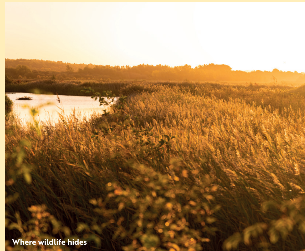
Where wildlife hides