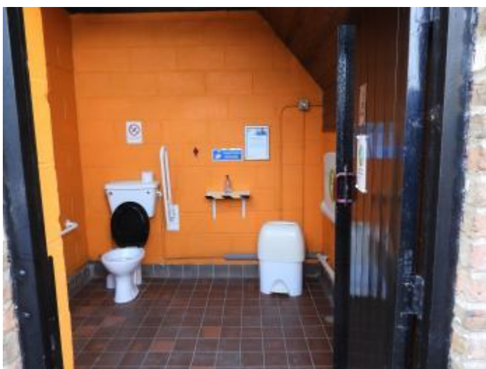
View through entrance to access spacious toileting and changing area