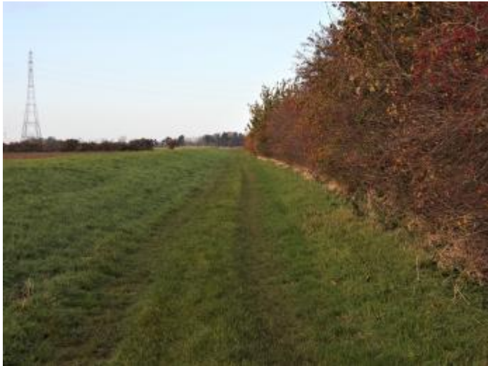
Main grassed pathway leading to grazing marsh view point, Ousefleet hide and viewing screen.