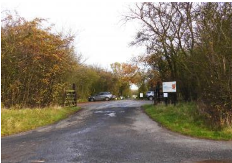
Main entrance to the reserve. The bus service stops here.