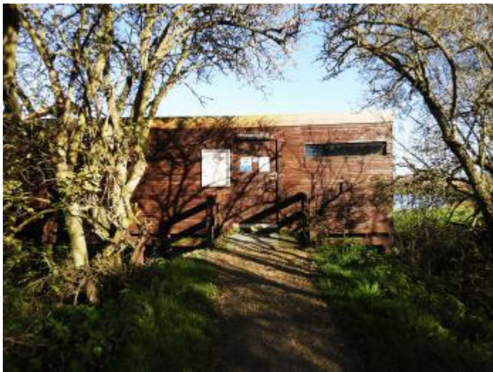
Townend hide approach up a gently sloping compacted limestone path to hinged door.

area. The widened lobby allows access visitors direct entry to a lowered viewing screen and removable chairs giving plenty of opportunity for mobility seated people to take in the wildy serene lagoon, wildlife and reed bed beyond. Further into the hide fixed bench style seating is provided.