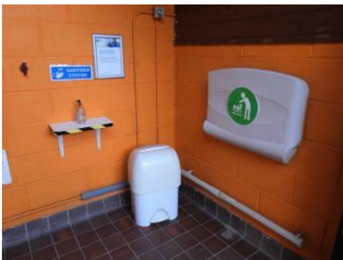
Baby and ostomy changing area.