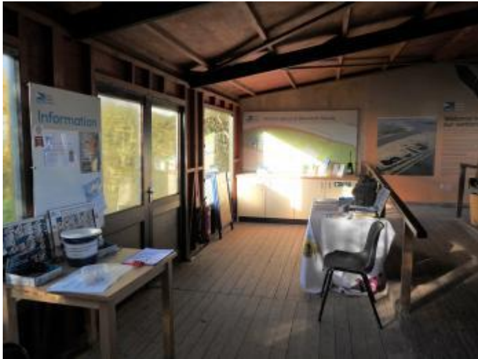
Greeting point area inside reception hide with spacious meeting point and access to upper viewing area.