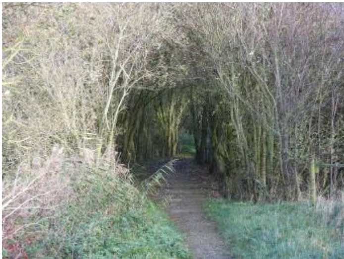
Entrance to short broken pathway leading to Ousefleet hide and viewing screen.