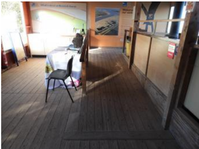
Gentle wooden ramp leading to spacious viewing area with access to wood burner.