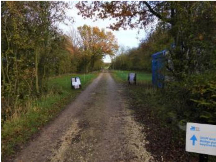
Wide compacted limestone pathway leading from car park to toilet block.