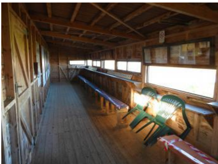
Access viewing point is close to entry with room for two seated mobility visitors.