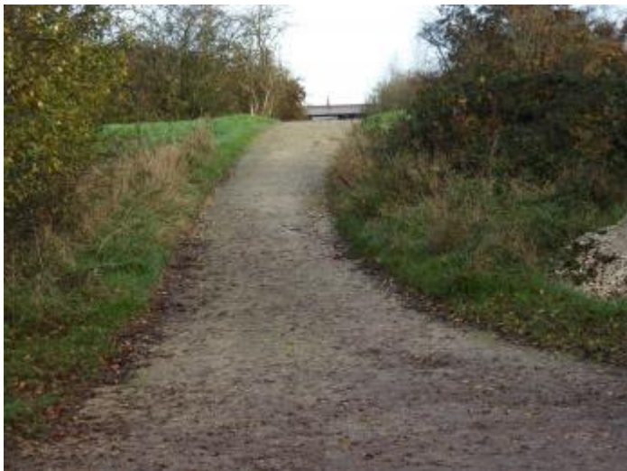
Flood bank slope leading to tree sparrow viewing point at it's apex.