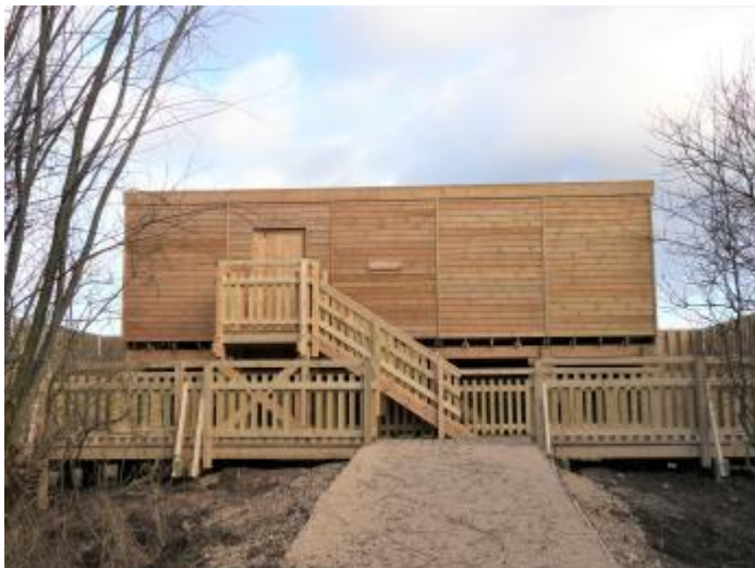
Gentle slope to platform with lower deck entrances left and right