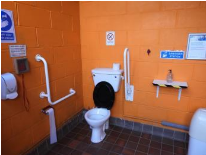
Toilet area showing hand rails both sides