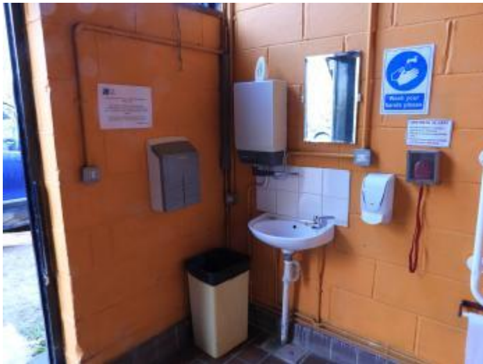
Washing facilities area, basin with lever handle taps