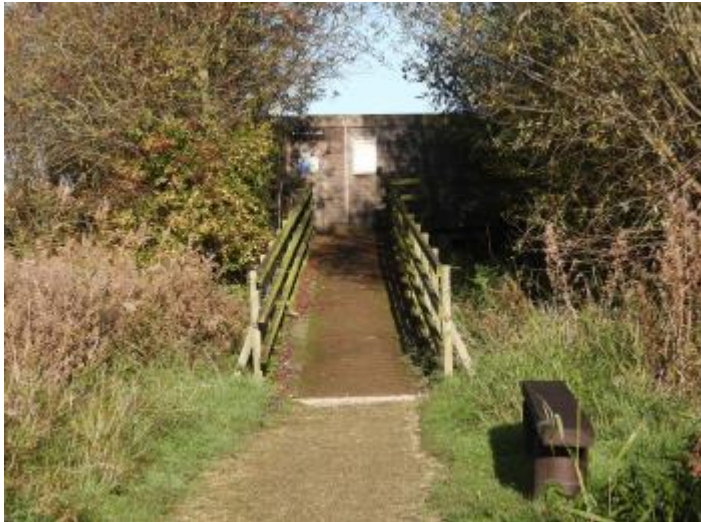
Wooden sloped approach to Marshland hide with bench style resting point.