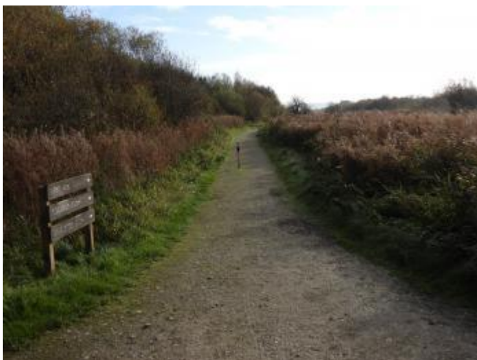
Main trail heading right towards First, Townend and Singleton Hides along compacted limestone path.