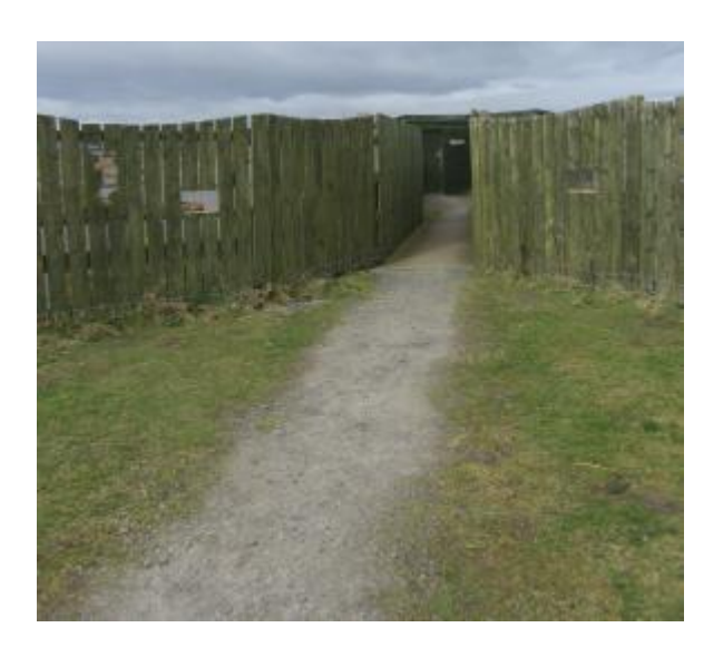
Path to Carden hide