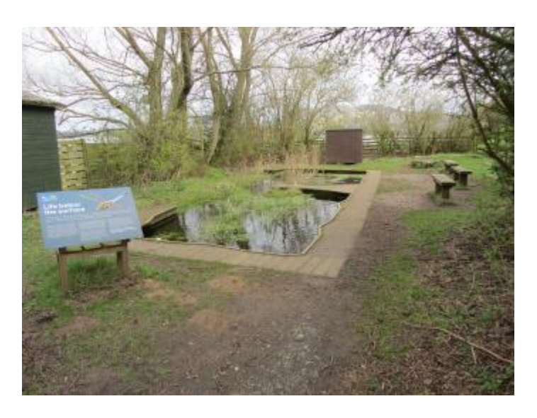
One of the two ponds at the Gillman hide