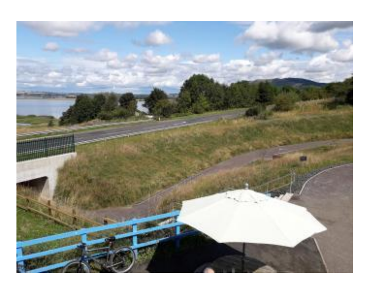
View from visitor centre over underpass area