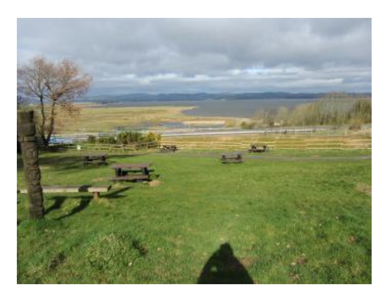
View of Loch Leven from picnic area