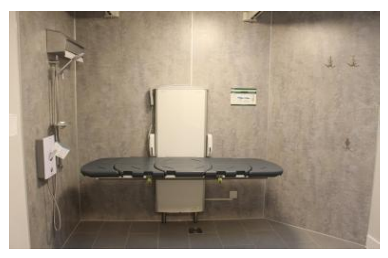
Changing Places changing table