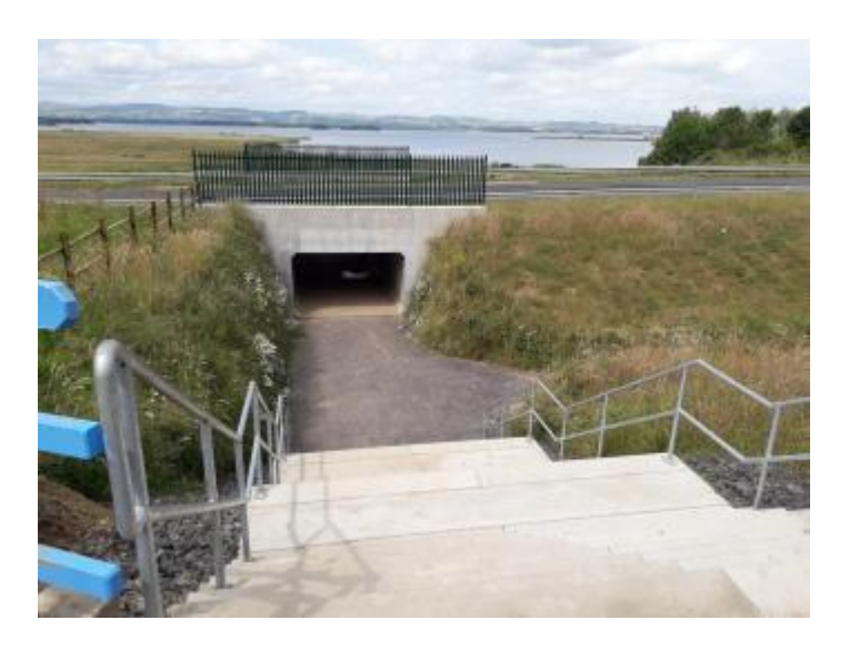
View of underpass from top of steps next to visitor centre