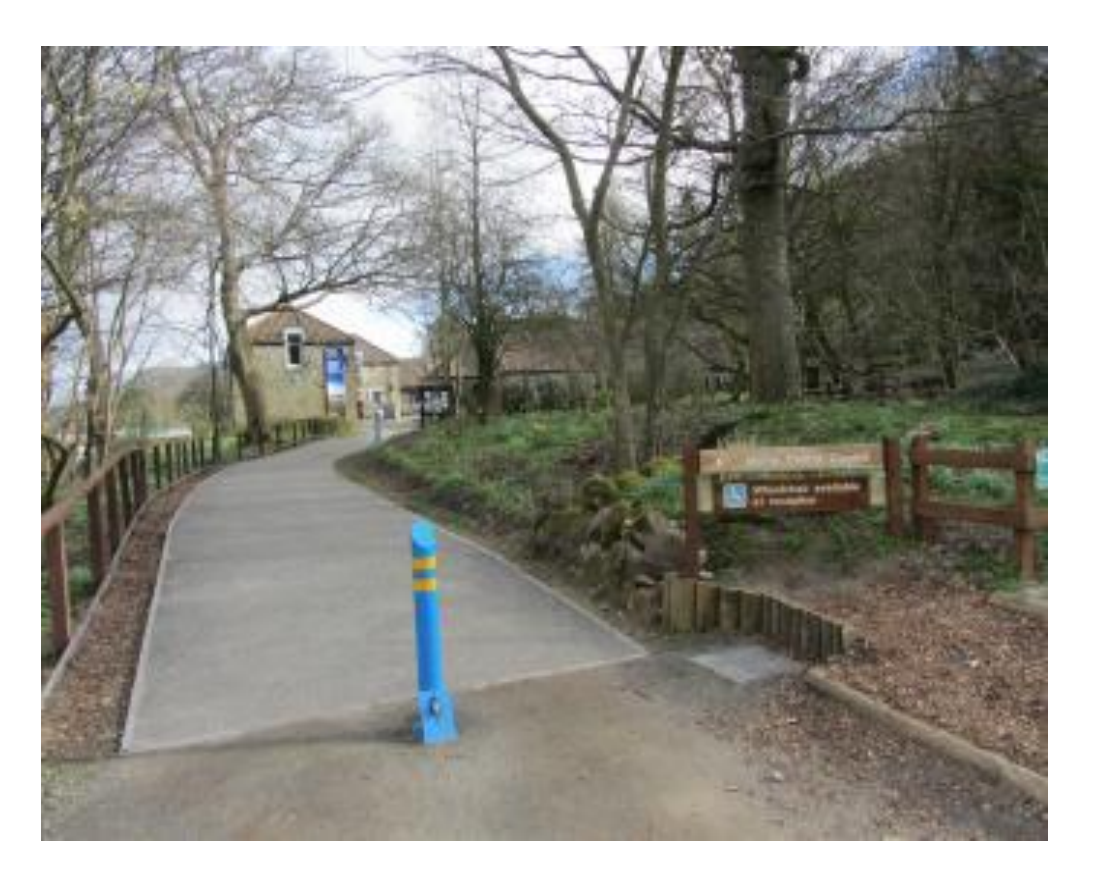
Path from car park to visitor centre