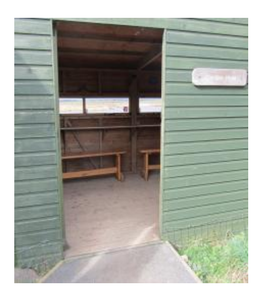
Carden hide door