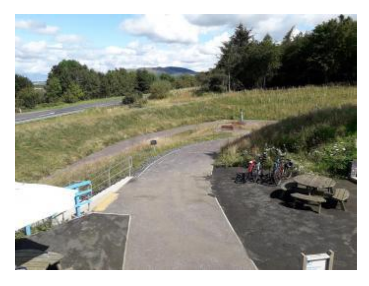
Path from visitor centre to underpass