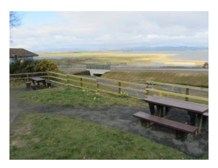
Picnic area tables with space for wheelchairs