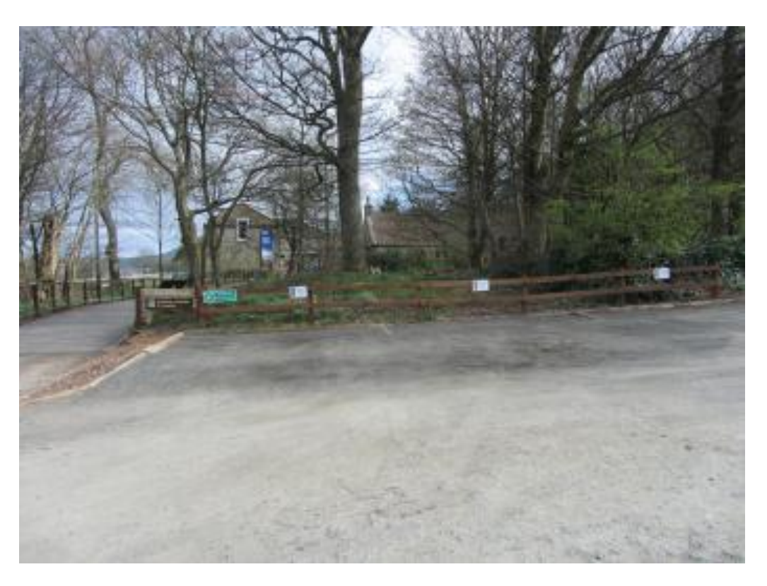
Accessible car parking spaces