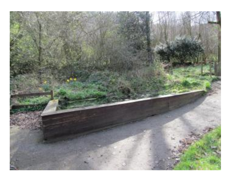
Raised pond in Wildlife Garden