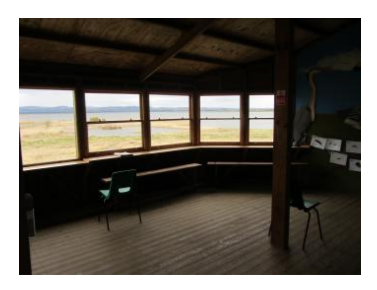
Gillman hide interior