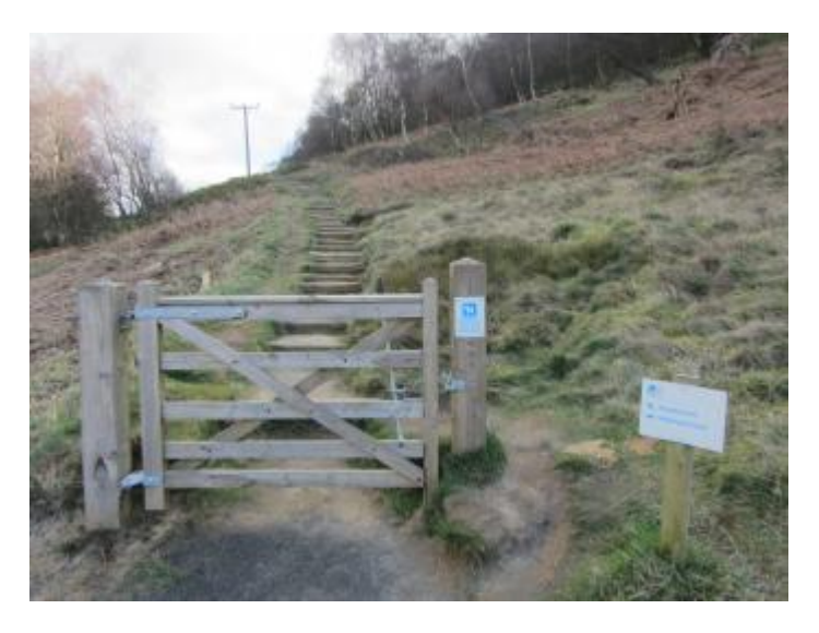
Gate to Woodland Walk and Vane Hill

This spectacular trail leads walkers through birch tree woods to a lofty viewpoint at the top of Vane Hill. This is a place to enjoy birdsong and wonderful view over the loch.