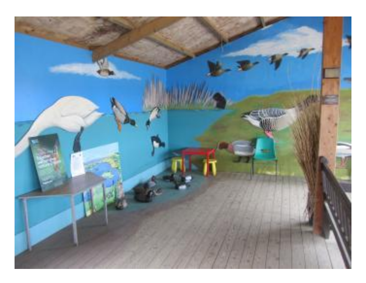
Gillman hide interior