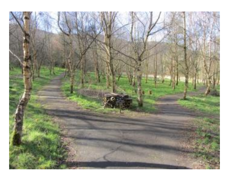
The Leafy Loop