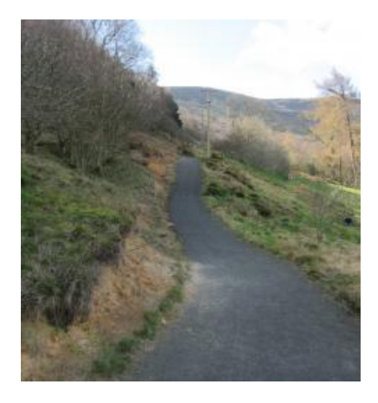
Start of the Sleeping Giant path

The trail is 7000metres long, with a hard surface. This invigorating hill walk has some very steep inclines and takes in stunning views of Loch Leven before continuing over Benarty Hill. It is not suitable for people with mobility difficulties and sturdy footwear is recommended.