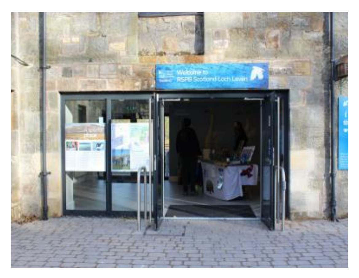
Visitor centre main entrance with doors open