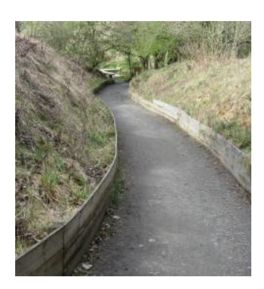
Wetland Trail leading to the Gillman hide