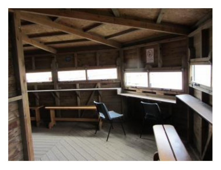
Carden hide interior