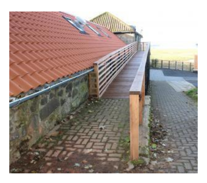
Ramp to café