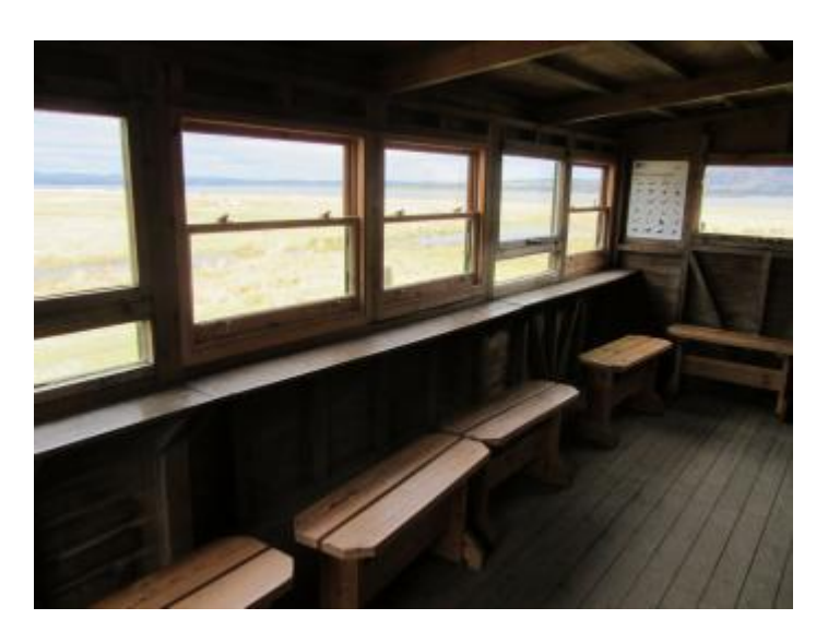
Waterston hide interior