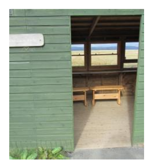
Waterson hide door