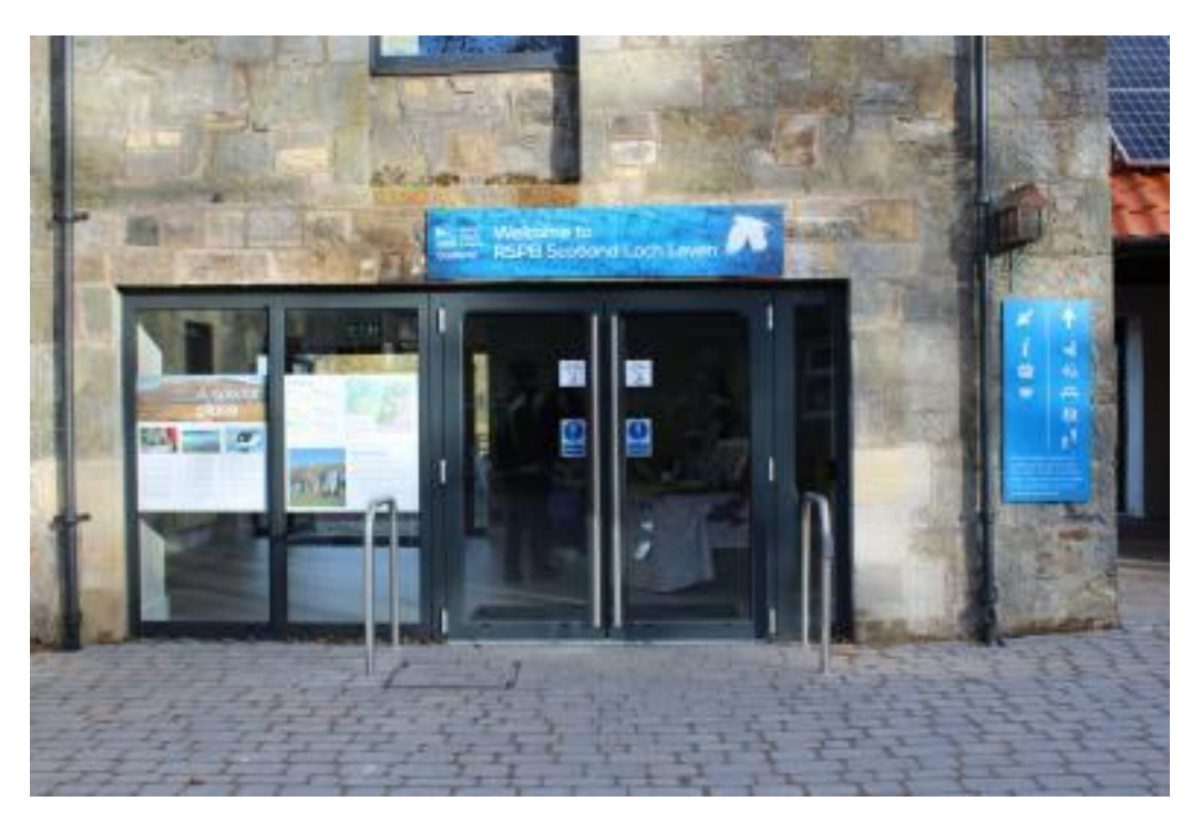
Visitor centre main entrance doors