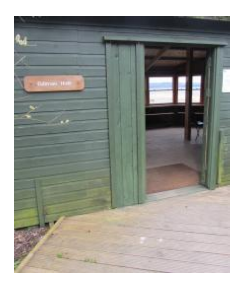
Gillman hide door