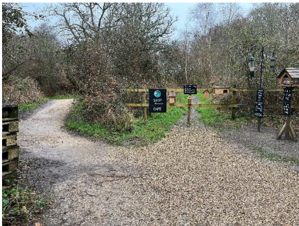
The paths that lead from the welcome area to the start of the trails and to the Shop & Cafe.