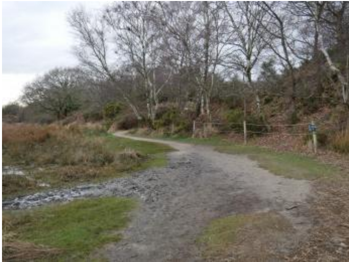
The alternative entrance to the shoreline.