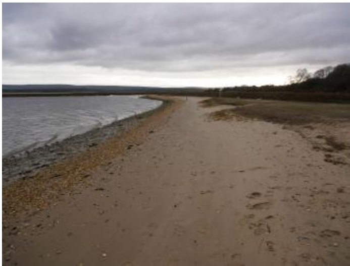
The shoreline at low tide.