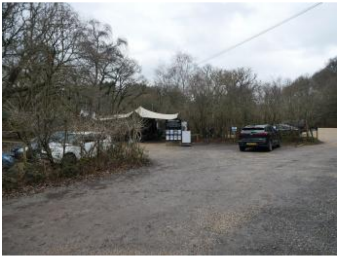
The main Arne car park, leading to the welcome area.

and other places are gentler, the trails are crisscrossed with protruding tree roots and some potholes. There is accessible parking further into the reserve and directions are given after checking in at the main reception. The accessible parking leads directly onto the accessible trail with level access.