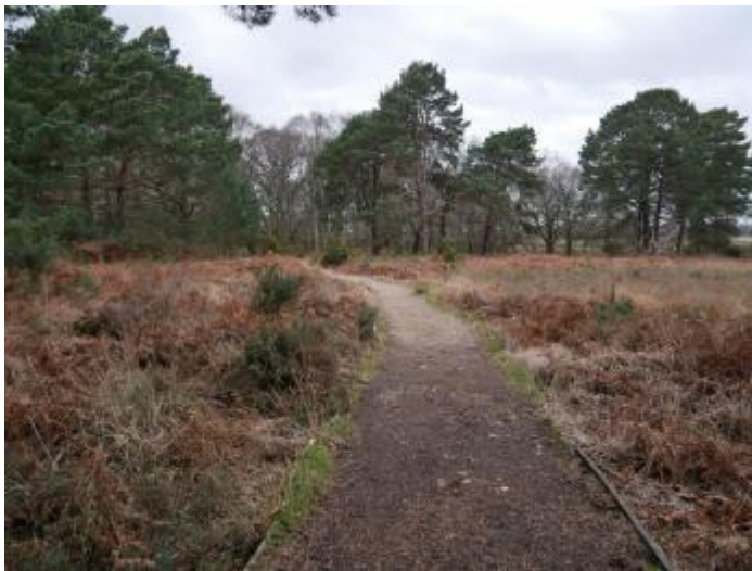
An example of the surface of the Easy Access Trail.