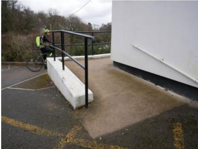
The ramp from the Shop & Café car park to the café main entrance door.

containing products are handled in the kitchen. We offer many options that do not contain nuts but we cannot guarantee they are suitable for allergy sufferers as they may contain traces of nuts due to production and storage.