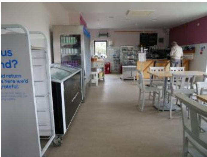
The path through the café.