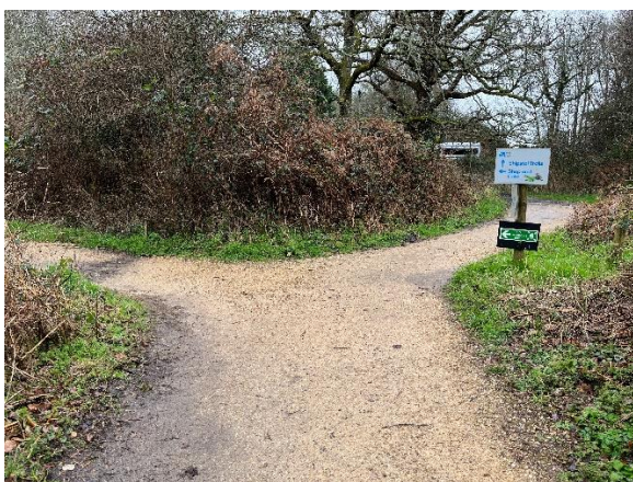
A continuation of the paths leading to the trails and Shop & Café, with a signpost.