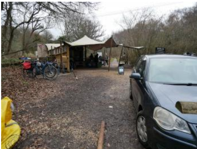
The approach to the welcome area from the car park.