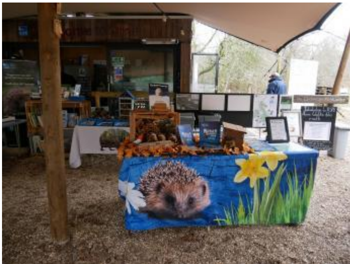
The Welcome Area.