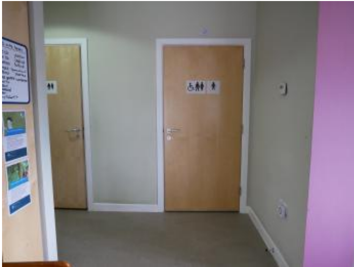
The entrance to the accessible toilet from the shop.