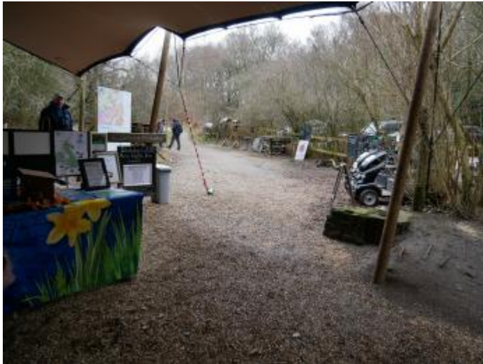
The path through the welcome area to the main entrance.