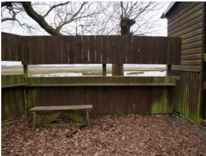
The accessible viewing screens.