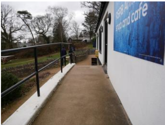
Continuation of the ramp to the main entrance door of the café.