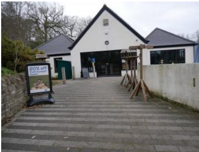
The route into the shop and toilets up the permanent ramp.