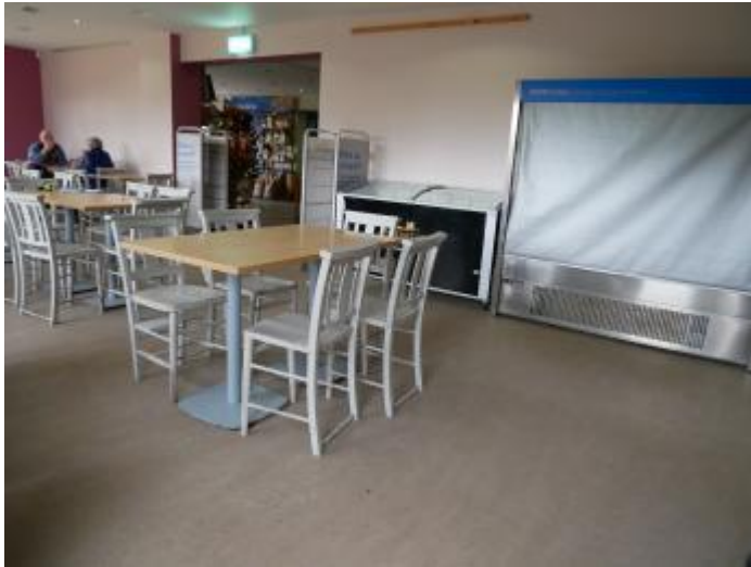
The view inside from the entrance of the café.