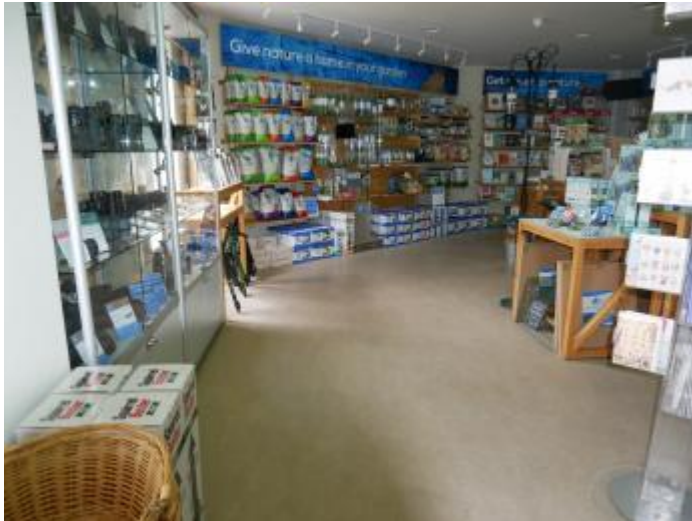
The inside of the shop.