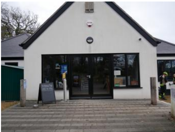
The approach to the shop.