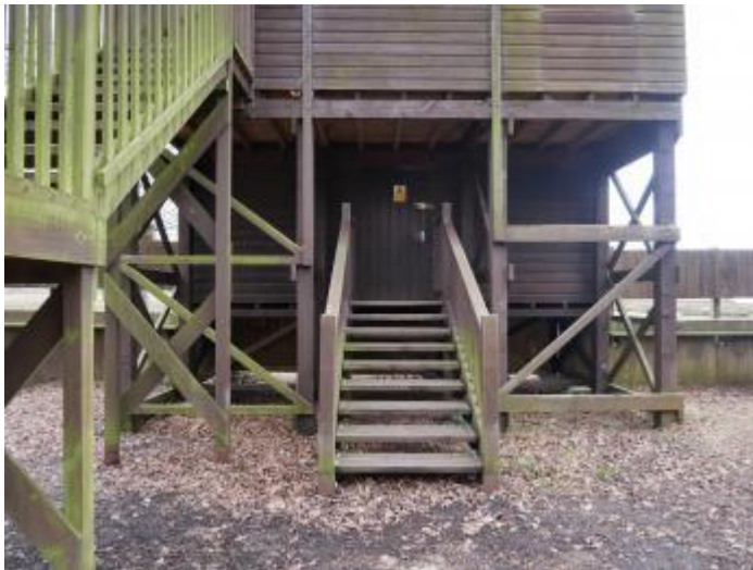
Shipstal Hide entrance.