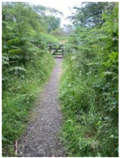
Gate along Shore Wood path