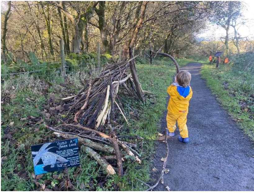
Den building area along Viewpoint trail