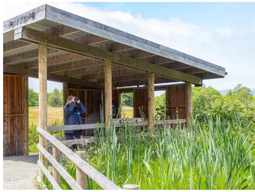
Shelter at pond area with seating