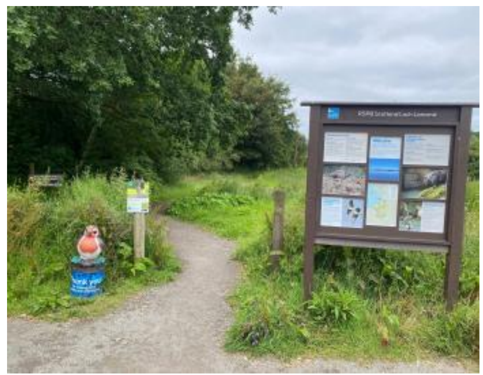
Entrance from nature hub to trails