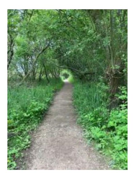
Family trail path with wooded edges