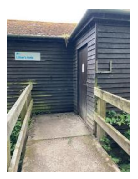
Lillian's hide entrance doorway