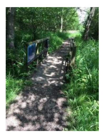
Lower trail footpath showing bridge