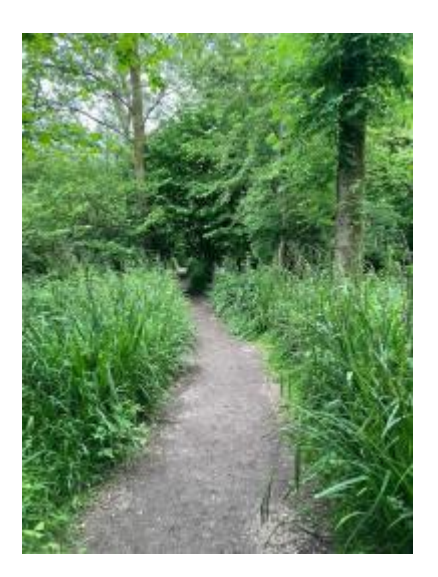
Family trail path