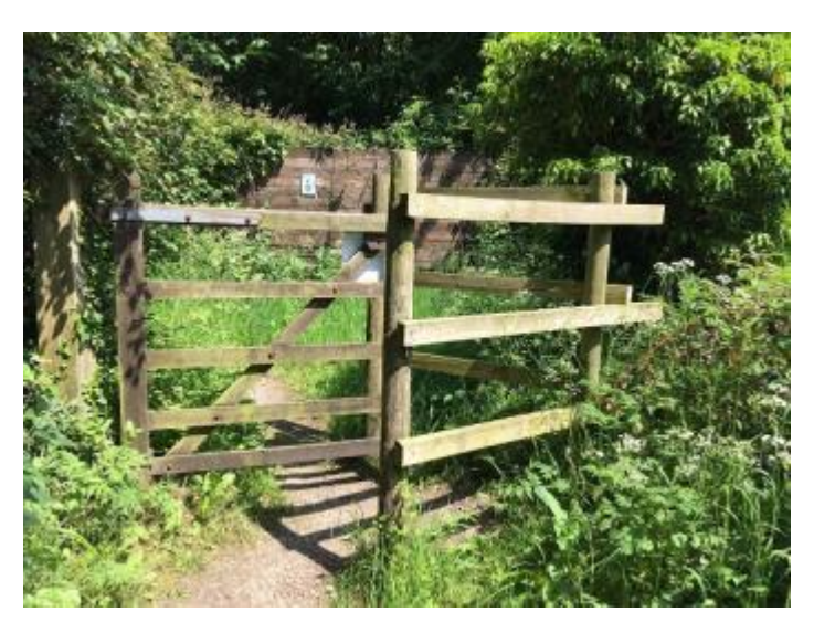
Lower Trail kissing gate