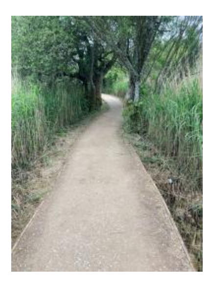
Family Trail near Grisedale hide