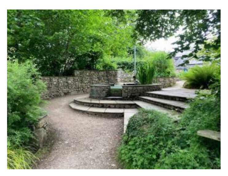
Garden steps and slope around pond