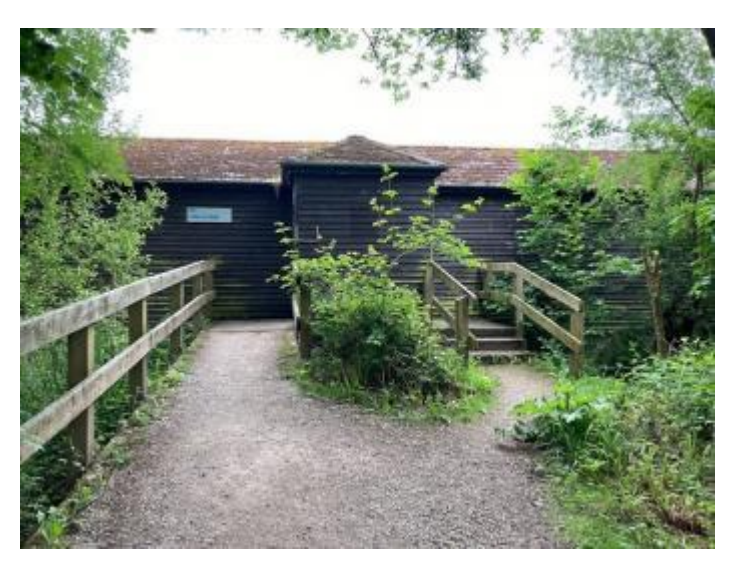
Lillian's hide approach showing slope and steps