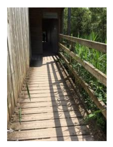
Causeway hide showing ramp and entrance to hide