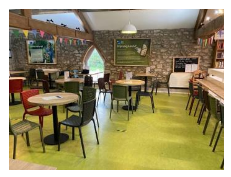
Visitor centre café seating area with tables and chairs showing some lighting