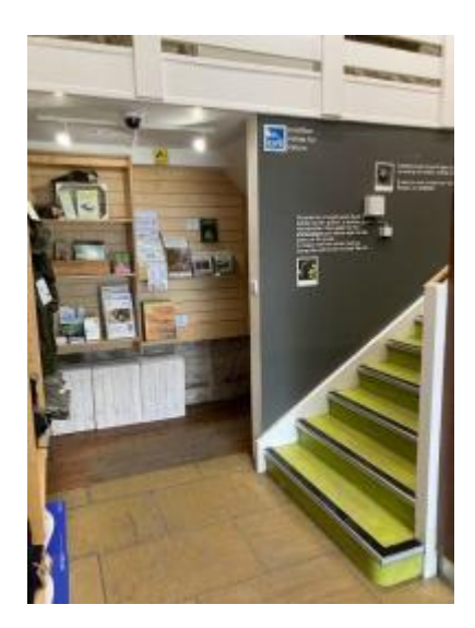
Visitor centre step access to café