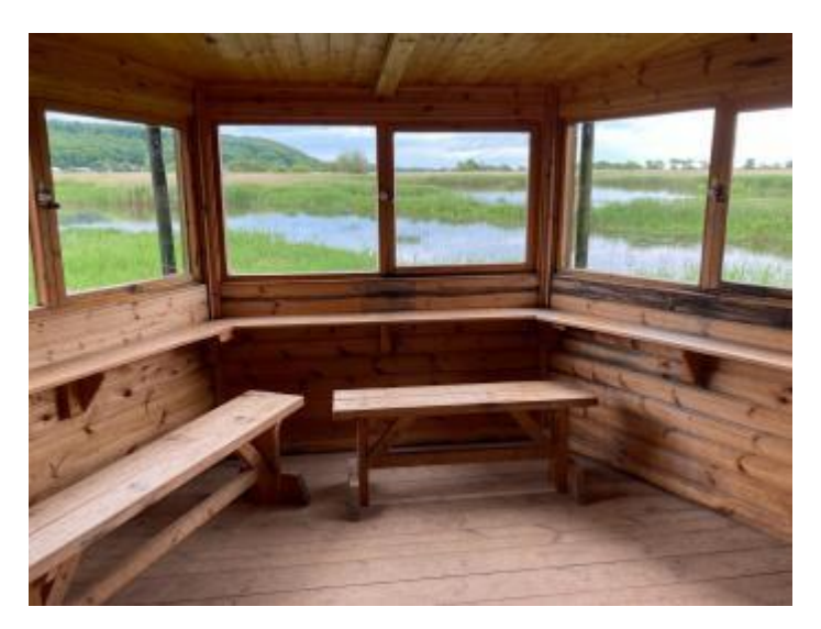
Tim Jackson Hide bay window with moveable benches