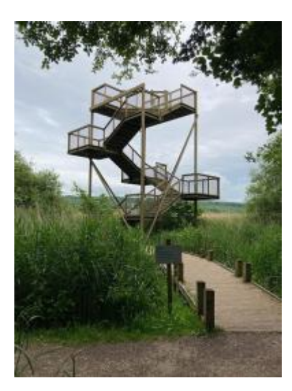
Skytower and boardwalk access to bottom of tower

The Skytower is 9m high and has 48 steps to access the top, with 3 landings situated at 16 steps, 24 steps and 32 steps. There is a handrail on all the stairways and barriers with narrow mesh to prevent any falls.