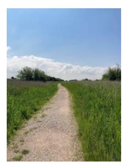
Coastal trail edged with reed