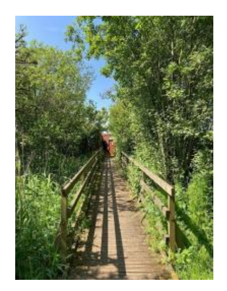
Access ramp to Eric Morecambe Hide