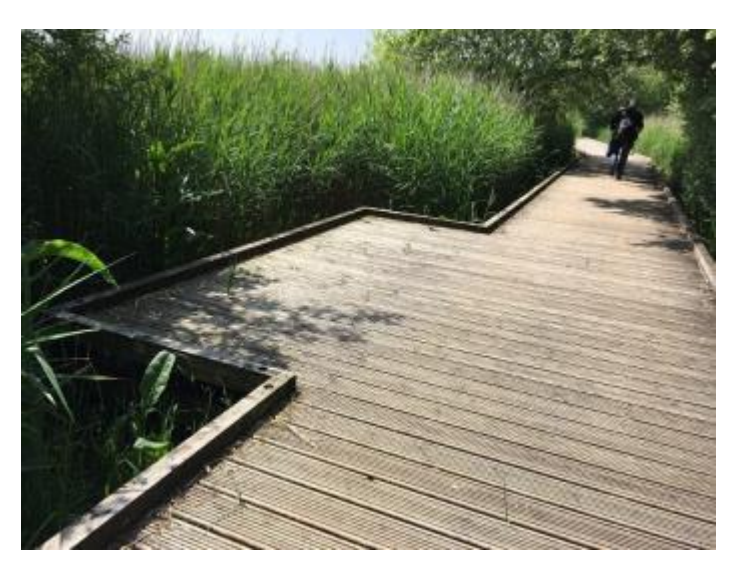
Reed edge trail passing place