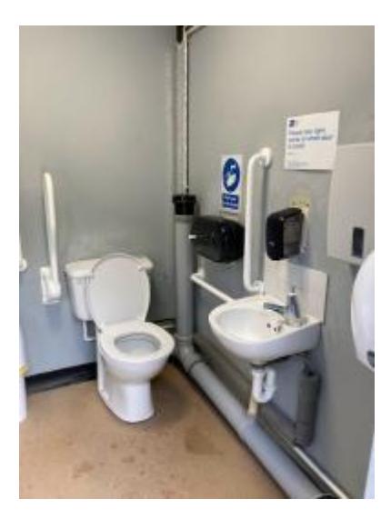
Visitor accessible toilet showing toilet and sink, plus grab handles