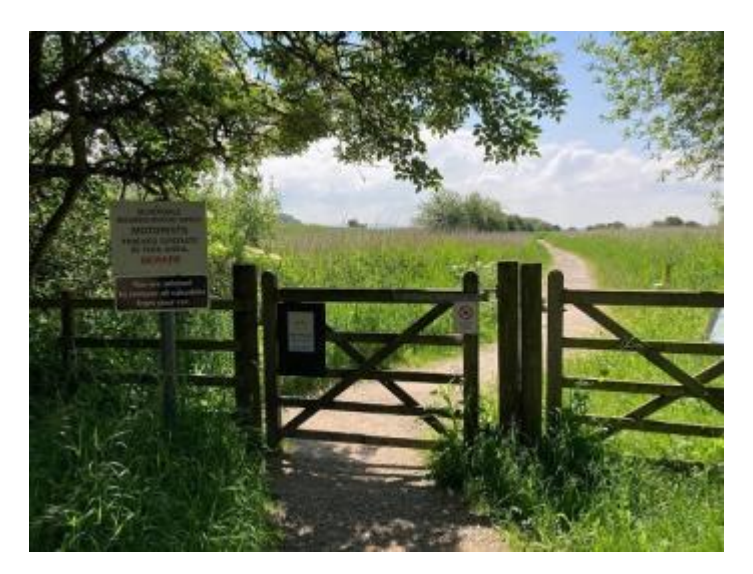
Pedestrian gate to Coastal trail