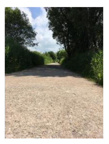
Lower Trail Causeway - public right of way