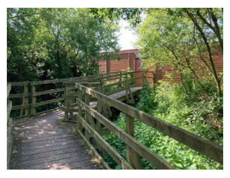
Access ramp and Allen hide entrance

The are no designated accessible spaces in this car park. The route from the car park to the hides is 1200mm wide or more