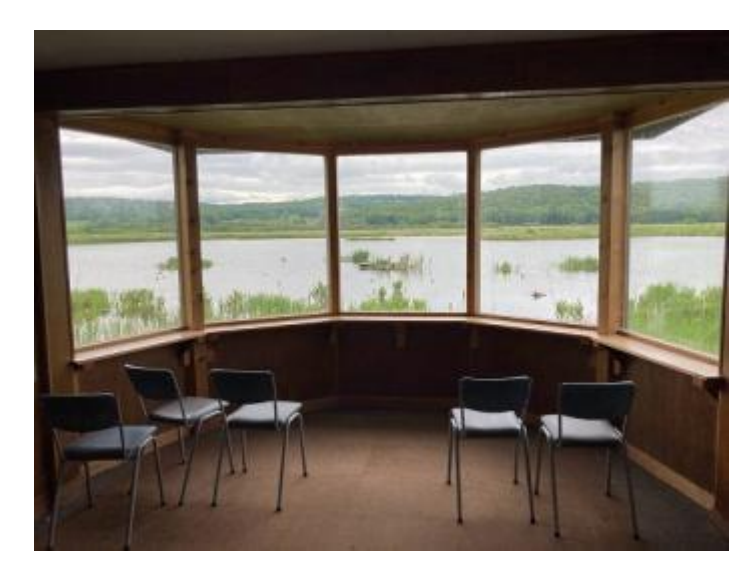
Lillian's hide bay window disabled accessible viewing space