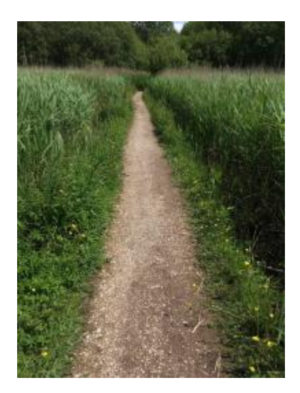
Lower trail path to Lower hide through reeds