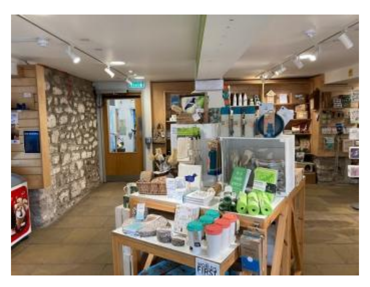
Visitor centre shop products and door through to toilets and reserve