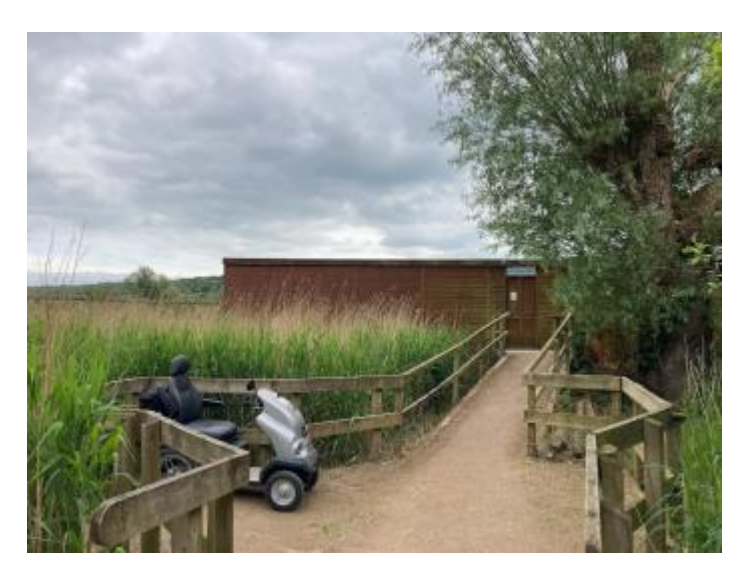
Grisedale Hide showing ramp approach and doorway plus space for Tramper parking