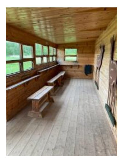
TIm Jackson Hide with low level window for wheelchair users