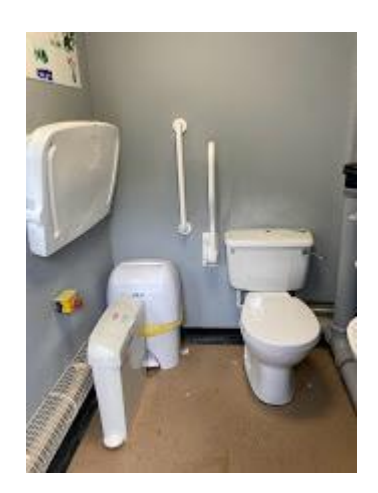
Accessible toilet with transfer space and handles