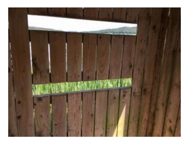
Causeway hide viewing slots outside the hide