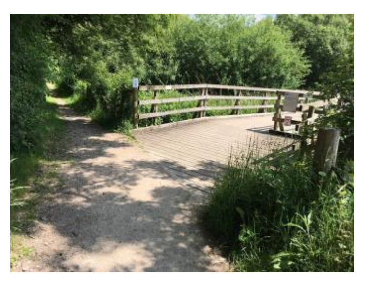
Reed edge trail board walk start showing hand rail