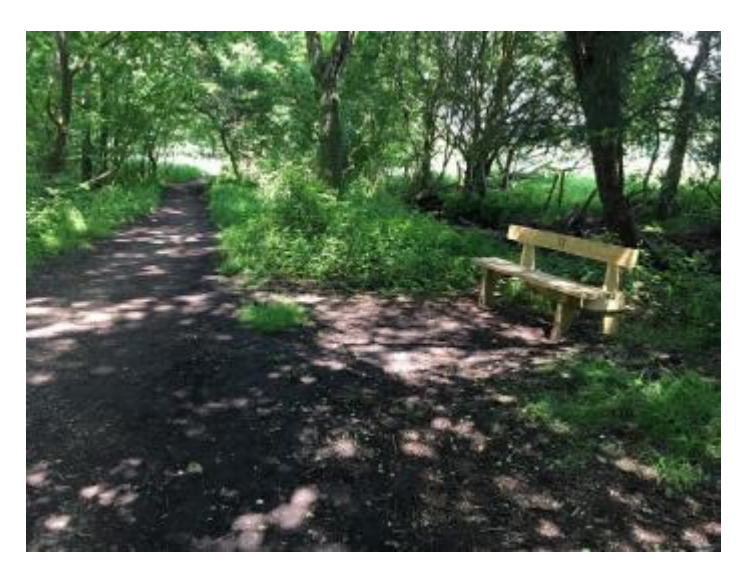
Lower trail footpath to Lower hide showing bench