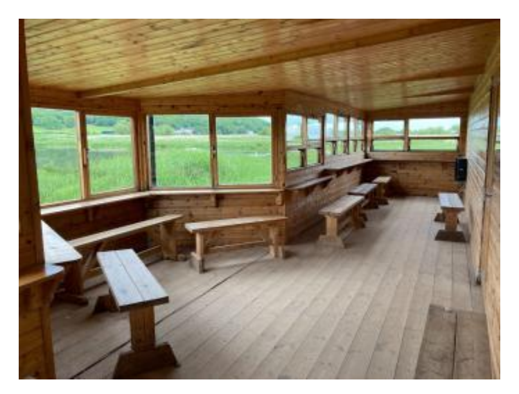
Grisedale Hide showing bay window and low level window for wheelchair users