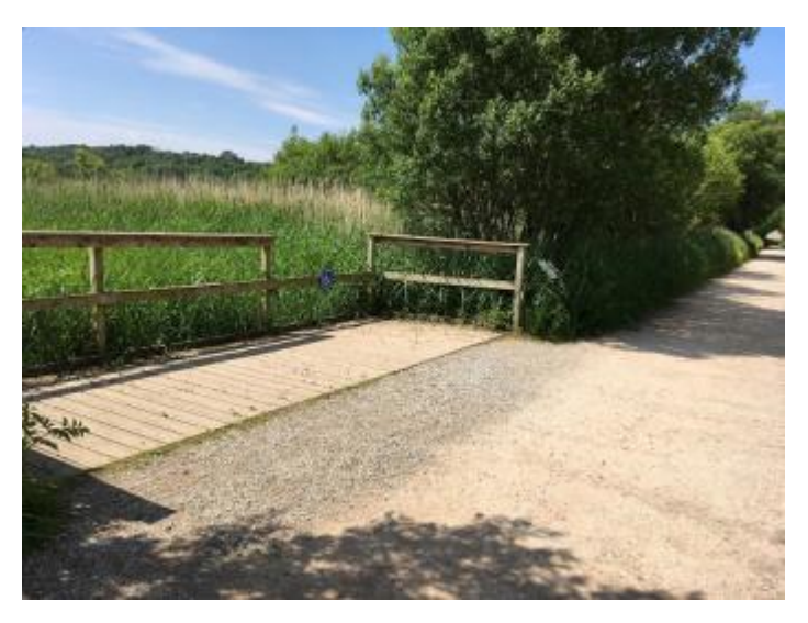
Lower trail bearded tit platform showing lowered viewing section for wheelchair users2