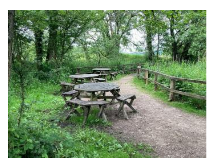
Pond dipping platform picnic area