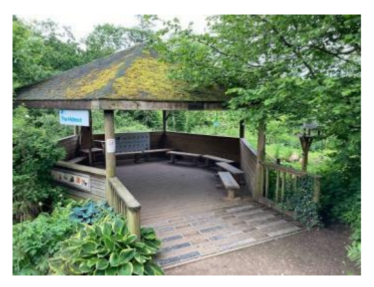
Hideout and approaching path

From the main entrance to this area, there is level access. There is a permanent ramp.