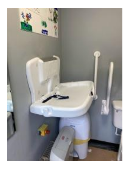
Baby change unit in accessible toilet