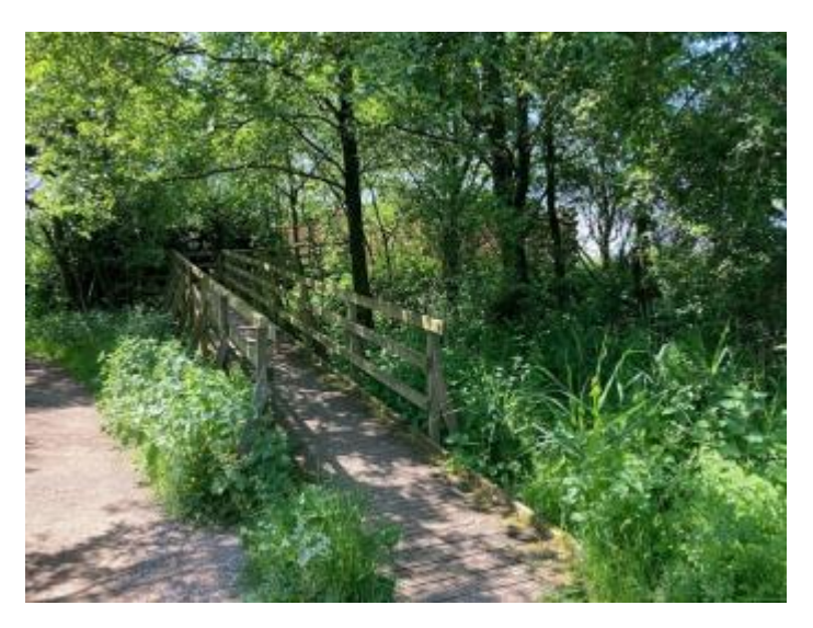
Access ramp to Allen hide