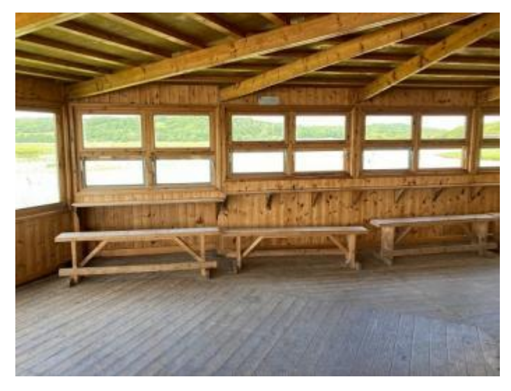
Inside Eric Morecambe hide showing lowered viewing area for wheelchair users