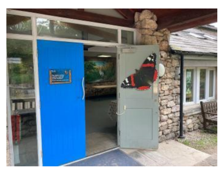
Entrance to Holt