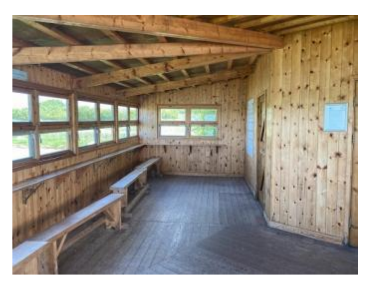
Inside Eric Morecambe hide showing large floor area