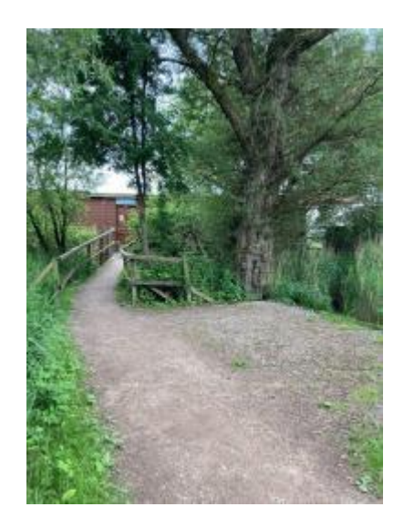
Tim Jackson hide approach showing ramp to doorway and space for Tramper to be parked on the right