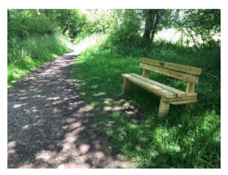
Lower trail footpath to Lower hide showing bench