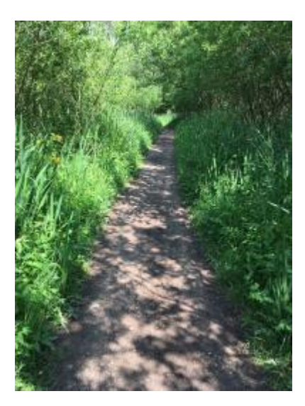
Lower trail showing footpath to Lower hide