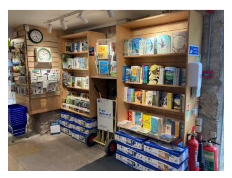
Visitor centre shop book display