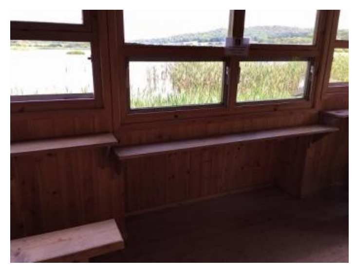
Causeway hide showing lowered viewing section for wheelchair users