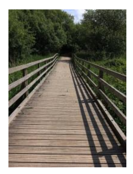
Reed edge trail boardwalk showing hand rails and slope