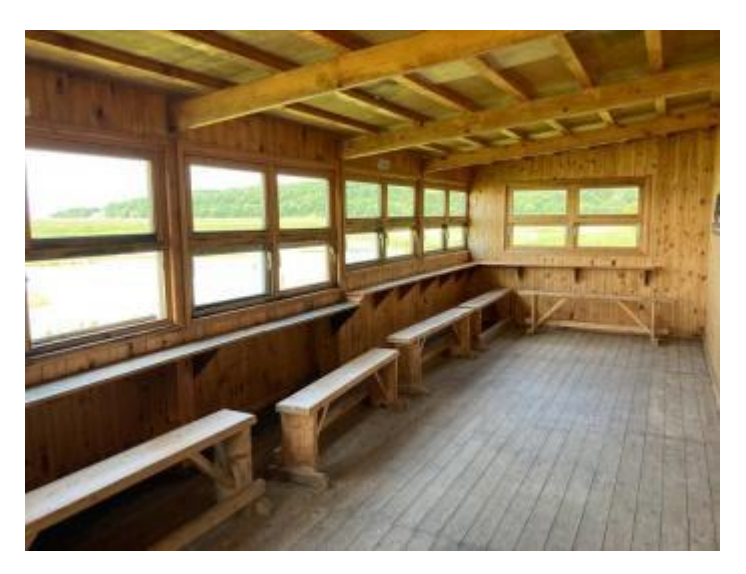
Allen hide inside with lower viewing area for wheelchair users