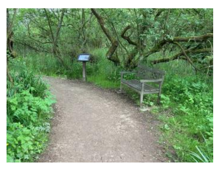
Family trail path bench