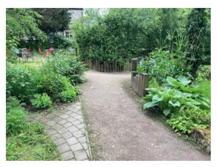
Sensory garden path narrowest section