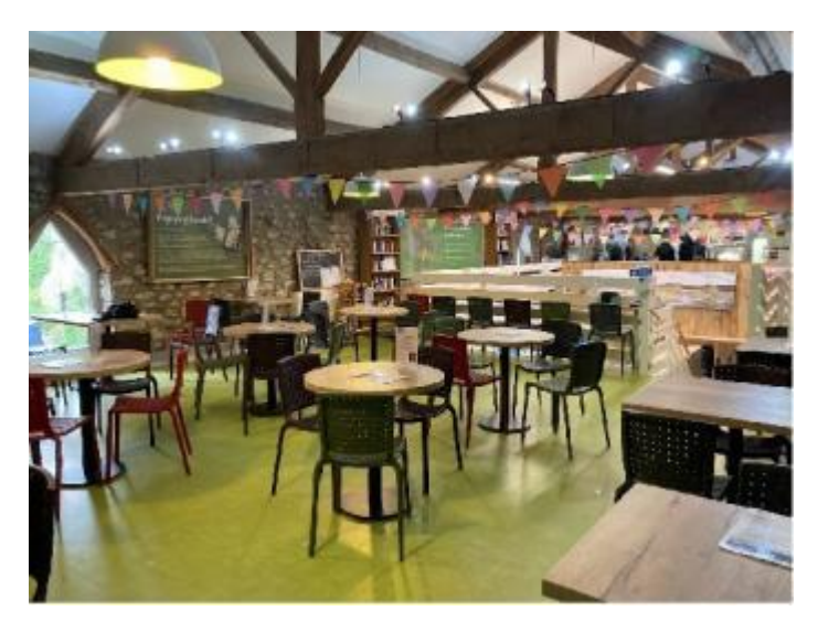
Visitor centre café seating area