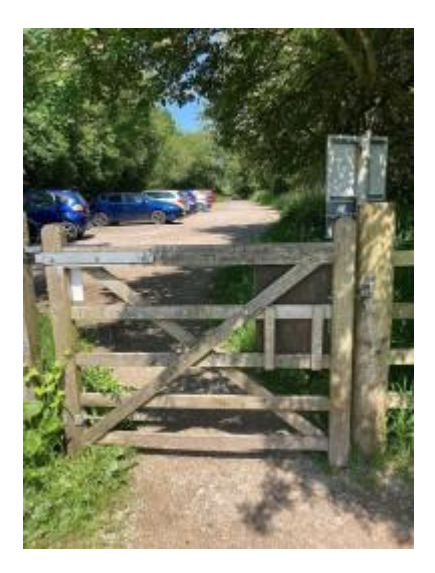
Latch on gate to coastal trail