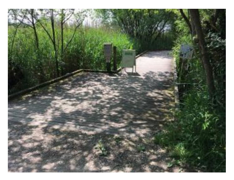
Reed edge trail board walk joining Causeway

The boardwalk has gripped panels and hand rails at the start where the height is raised.