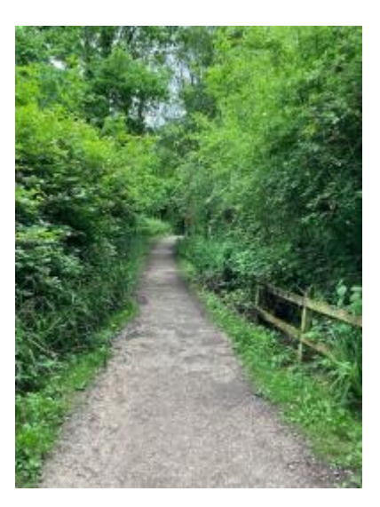
Path from garden to Skytower and Lillian's Hide