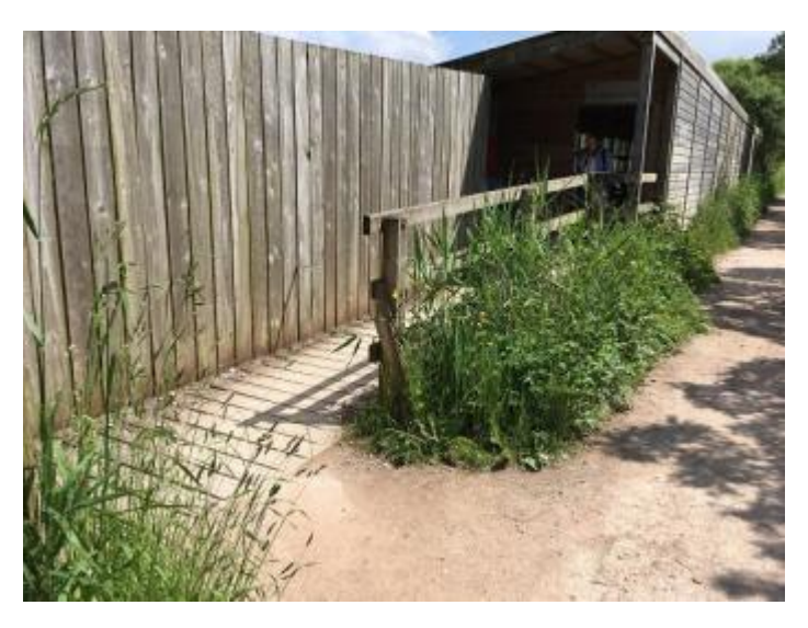
Causeway hide showing ramp access