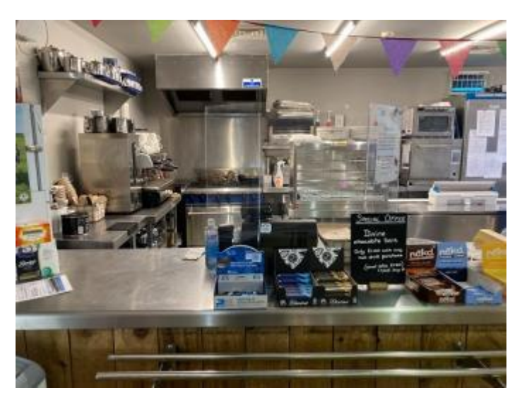
Visitor centre café showing till area

Visitor centre café showing counter with till, queue area, and counter with cutlery, conditments and water