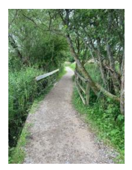
Family trail path bridge