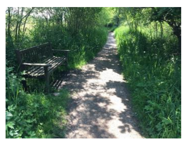
Lower trail footpath to Lower hide showing bench