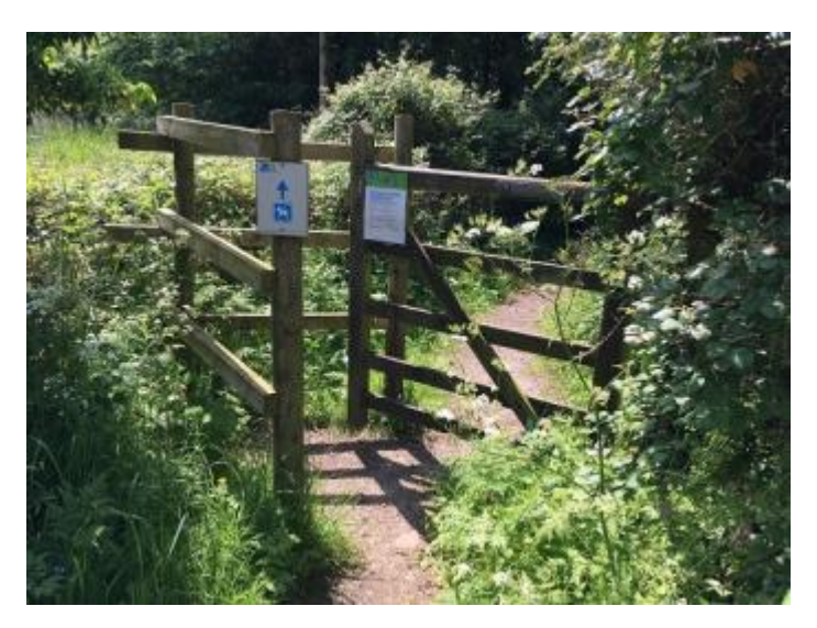
Lower Trail kissing gate