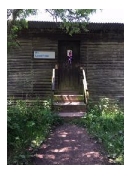
Lower hide showing steps and doorway into hide