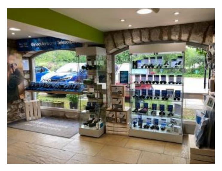
Visitor centre shop binocular and telescope display