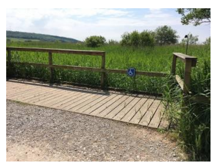
Lower trail bearded tit platform showing lowered viewing section for wheelchair users