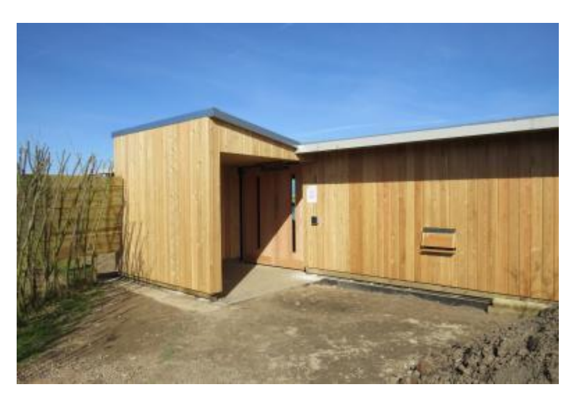
Wildlife Watchpoint Hide