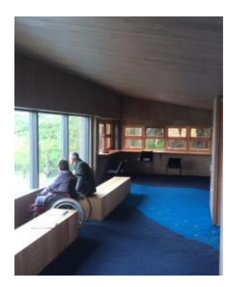
Wildlife Watchpoint interior