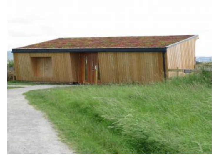
Paddy's Pool hide

The path is a minimum of 1m wide and is surfaced in bound gravel.