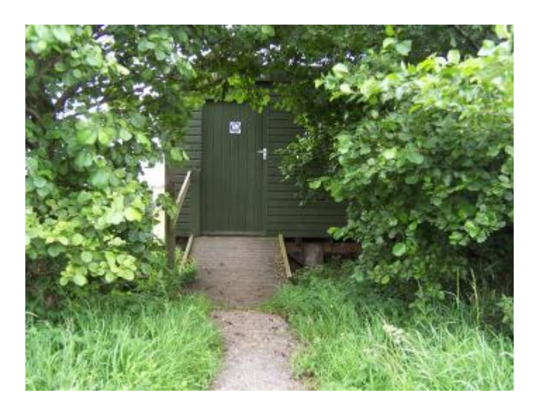
Dormans Pool hide