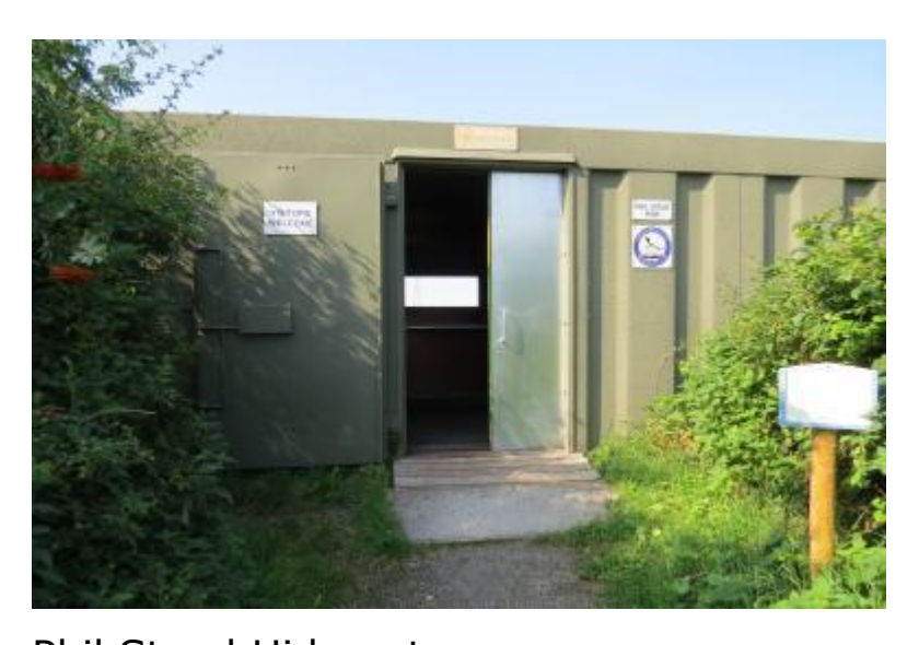
Phil Stead Hide entrance