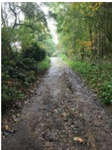
road slope towards start of trail