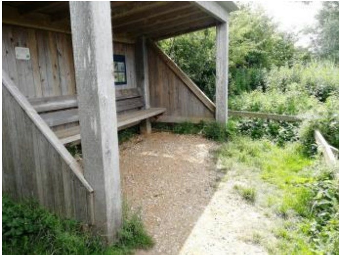
Surlingham Shelter, showing open fronted viewing facility