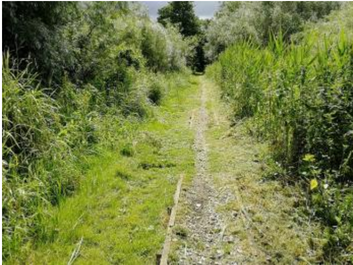
Raised hard path 630mm wide, situated at lowest point of the trails prone to flooding