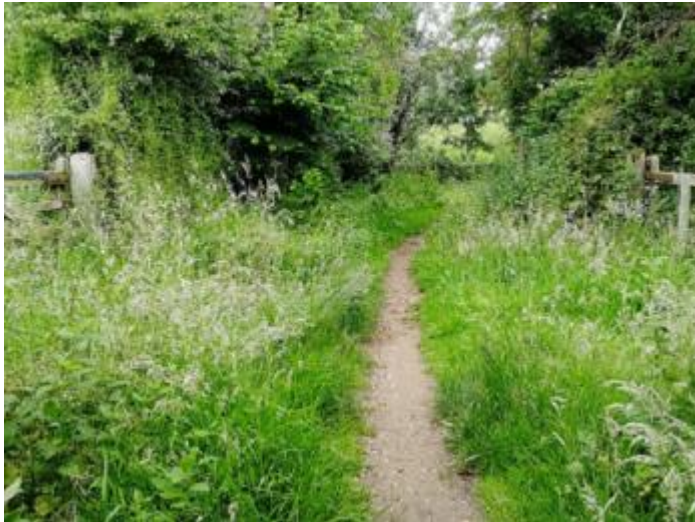
path at entrance to the reserve