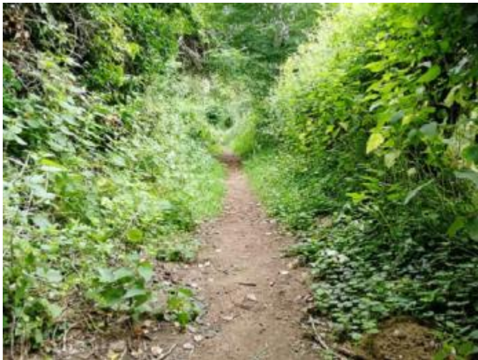
Non- rspb path showing slope and trail surface