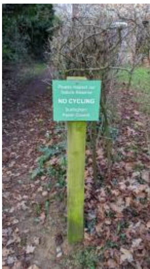
Sign at start of path