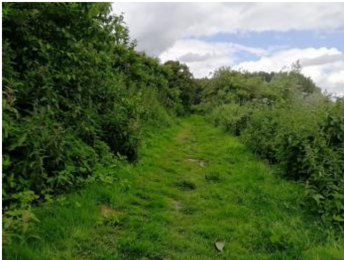
general path conditions during summer