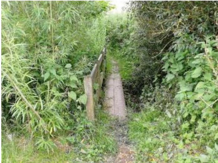
Non-rspb bridge 620mm wide currently