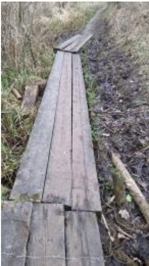
Non RSPB Boardwalk