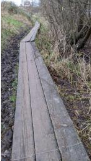
Non RSPB Boardwalk

the boardwalk, leaving it extremely uneven. The boardwalk is due to be replaced and this guide will be updated when the work is completed.