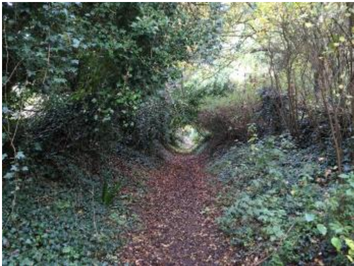
Path from road to riverbank path showing slope