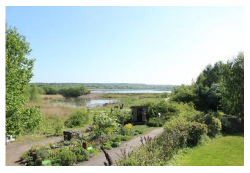
View from the cafe balcony