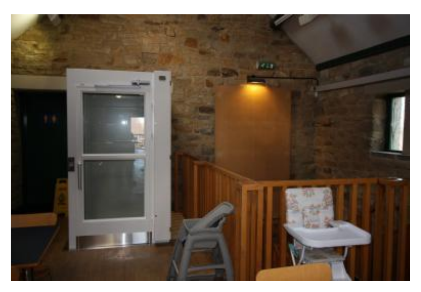
Lift from the cafe