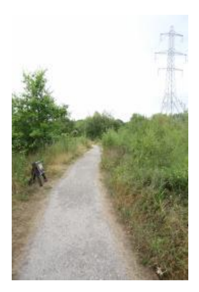
Green lane path

Seating and refuge points are situated approixmately every 100m. Most of the benches are made from wood or recycled plastic, with and without backs.