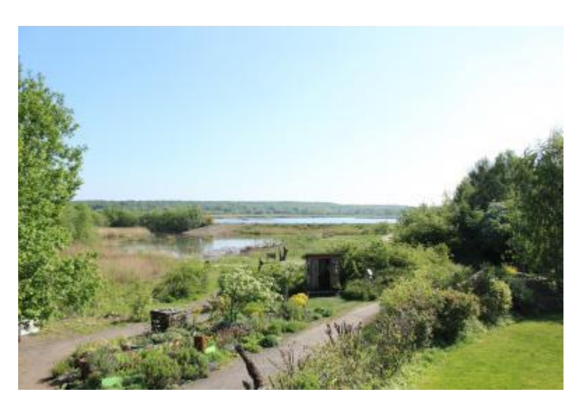
View from the balcony at Old Moor

The lawn has 3 entrance points the smallest of which is a meter wide, the largest of which is around 3m wide from a 5 bar gate.