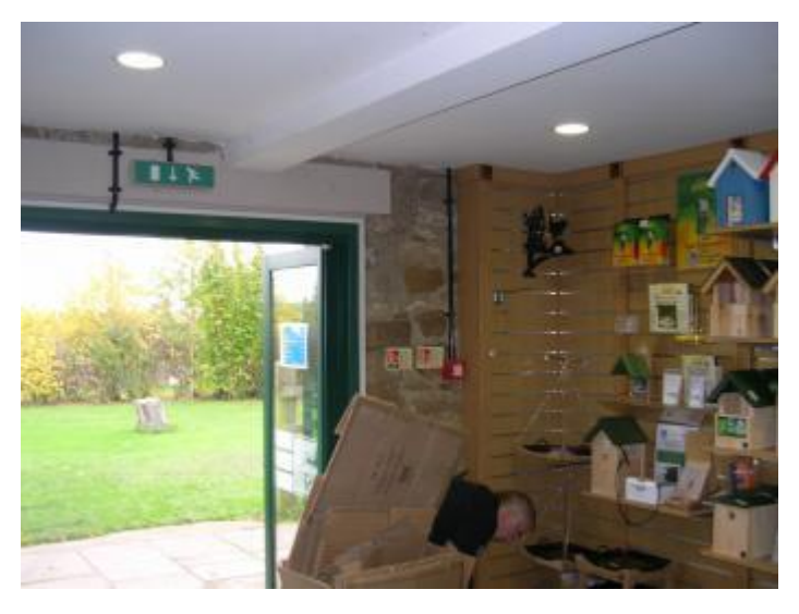
Door leading out to the reserve