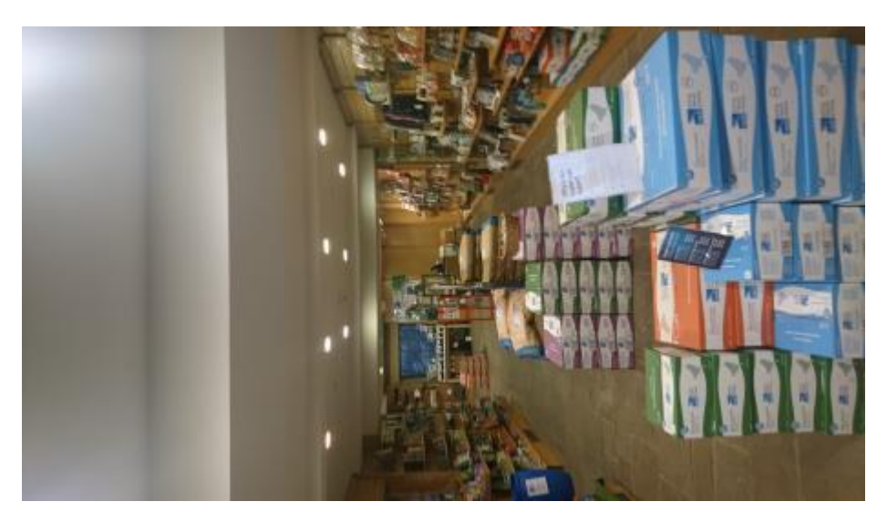
Bird seed display in the shop