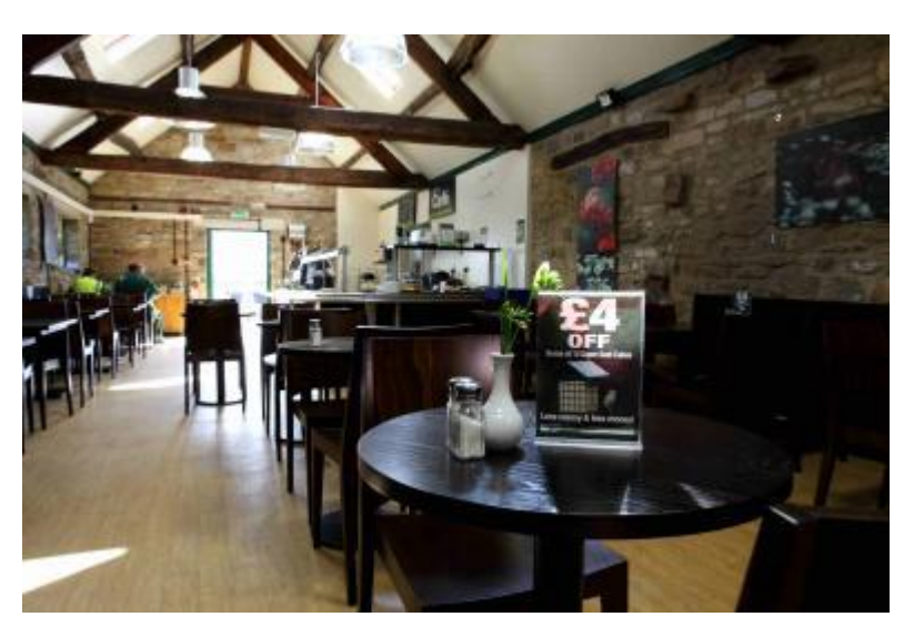
Inside the cafe