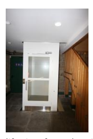
lift view from the visitor centre