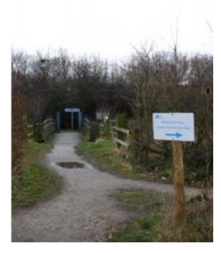
Trans Pennine Trail pathway leading to Old Moor