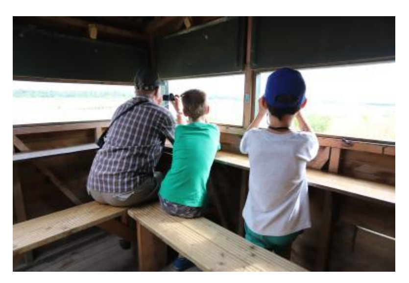
Family in a hide