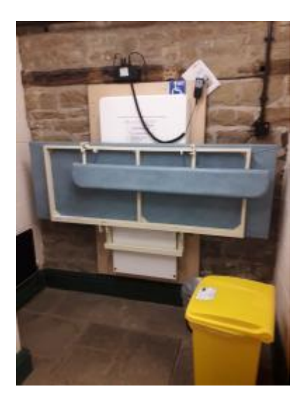
Changing table and hoist in the disabled toilet

One of the Visitor Centre accessible toilets has changing facilities (table and hoist) and the other has baby changing facilities.