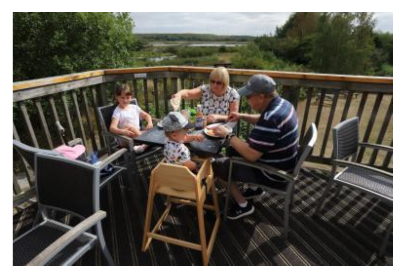
Family using the balcony