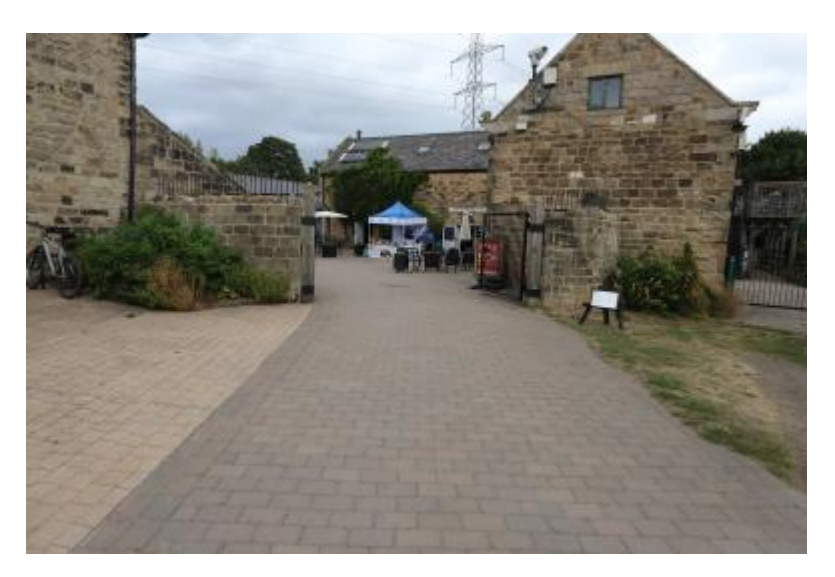
Walkway to RSPB Old Moor courtyard

The car park is hard standing and the path to the visitor centre is either paved or hard standing.