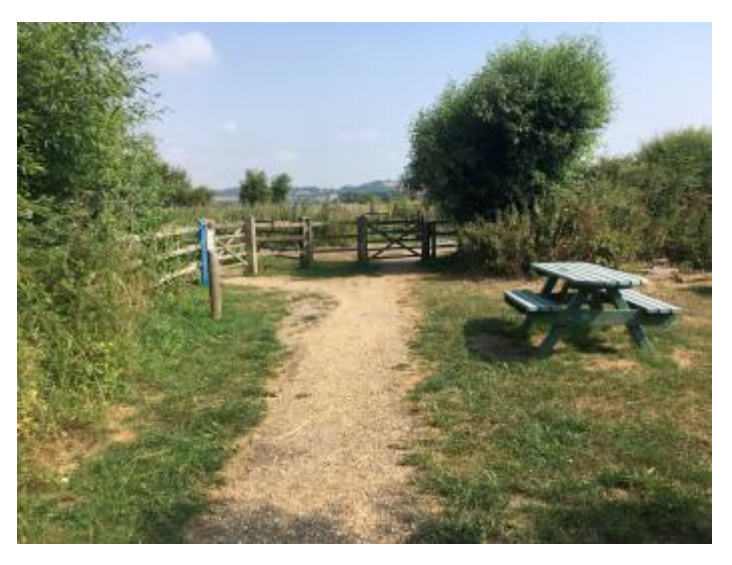
Photo from 2019. The picnic area at the entrance of RSPB Greylake. There is no indoor entrance to RSPB Greylake.

There is a viewpoint on the left-hand side of the car park which gives a view over part of the reeds. This can be accessed by ramp (1:16 gradient) or a flight of 10 wooden steps. The ramp has a grass surface which has grown over plastic matting. There is a wooden handrail on both sides of the stairs and a handrail on one side of the ramp (the right hand side when going up and the left hand side when going down).