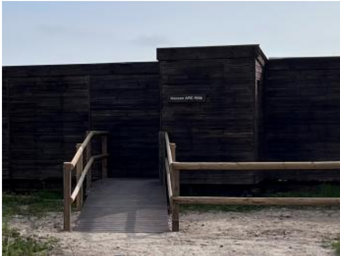
Hanson Hide Ramp