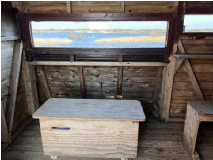
Christmas Dell Hide Accessibility Seat