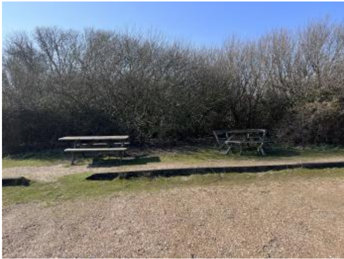
Car Park Picnic Benches

litter home with you. Or use the recycling bins provided in our visitor centre. Thank you.