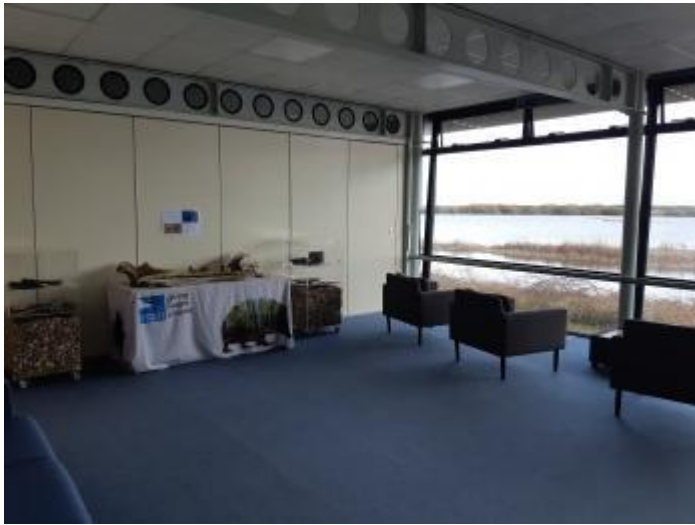
Visitor Seating Area

can be moved and adapted if more space is required. More seating is available upon request.