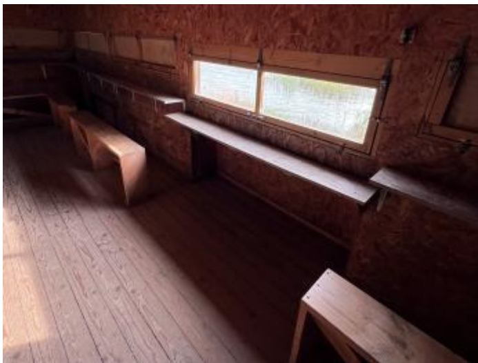
Hanson Hide Accessible Seat