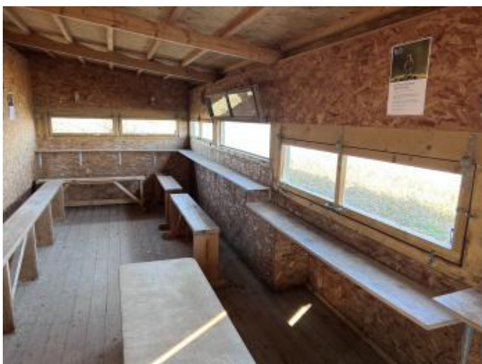
Dennis's Hide Interior