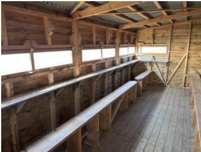
Dengemarsh Hide Interior