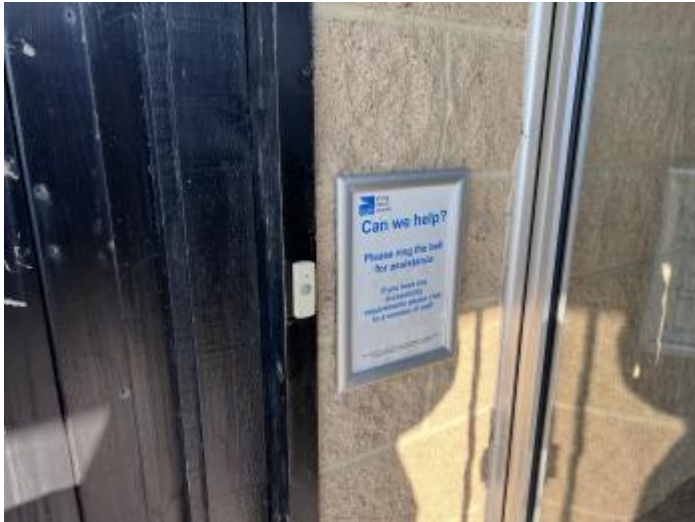
Doorbell at Entrance