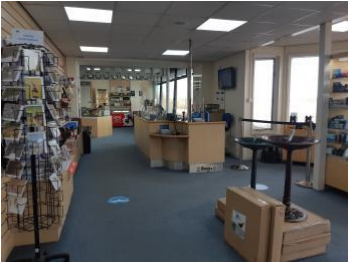
Shop View 1

ideas and cards. We also offer a full range of binoculars and telescopes which are available to try in-store, just ask a member of staff for assistance.