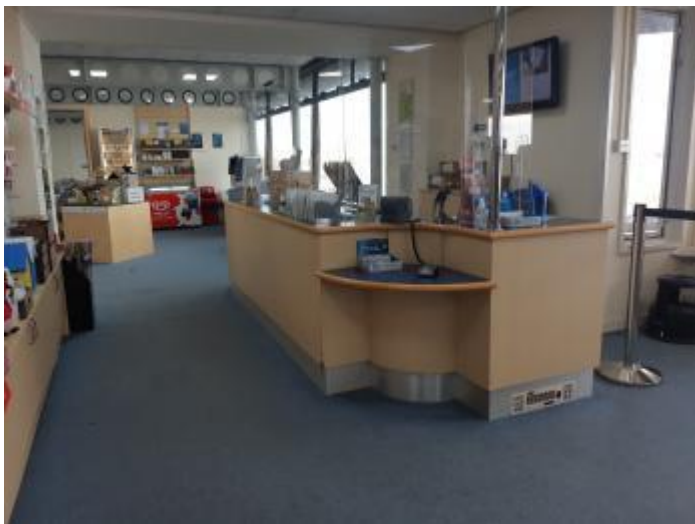
Shop View 4