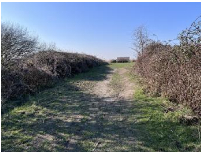
Viewing Ramp Entrance