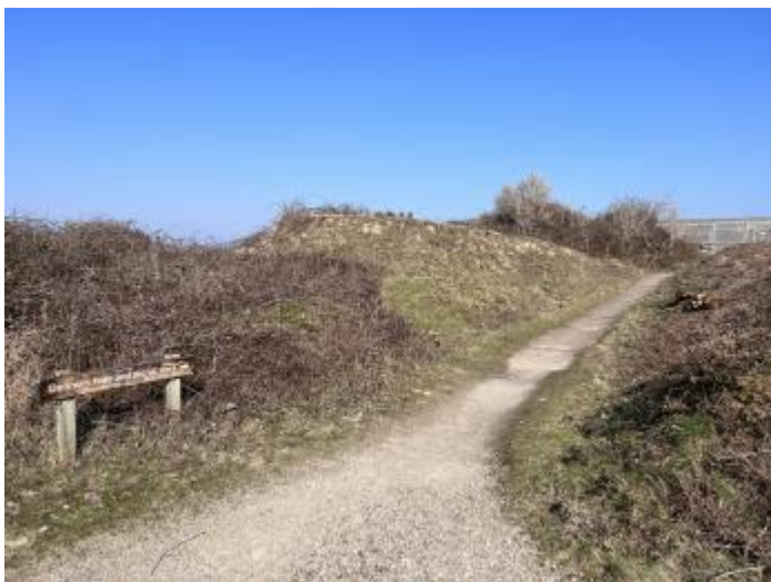
Dennis's Hide Trail