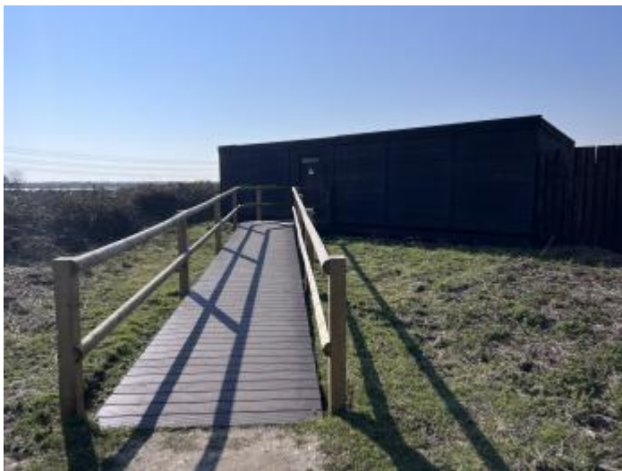
Dengemarsh Hide and Ramp