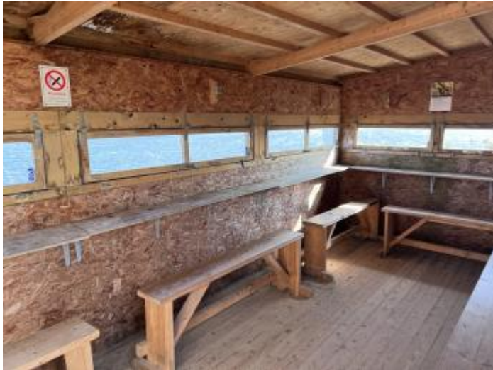
Dennis's Hide Interior