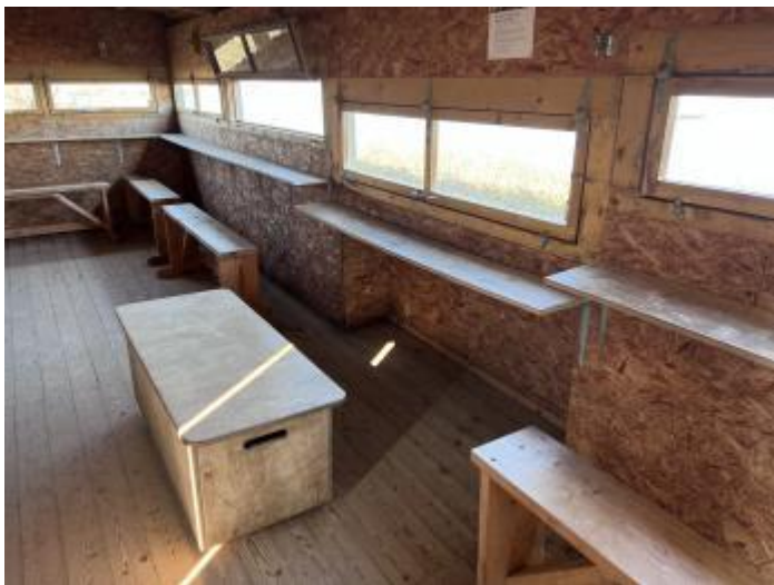
Dennis's Hide Accessibility Seat