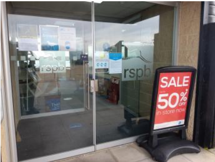
Front Door Entrance to Visitor Centre

reference to the entrance to the visitor centre. The main entrance to the Visitor Centre is accessible through a small vestibule. The vestibule has two side hung glass doors at staggered intervals, the main entrance door and an internal door. The main door opens outwards to the left, the internal door outwards to the right. At the first door there is a door bell for those who need assistance with the opening of these doors.