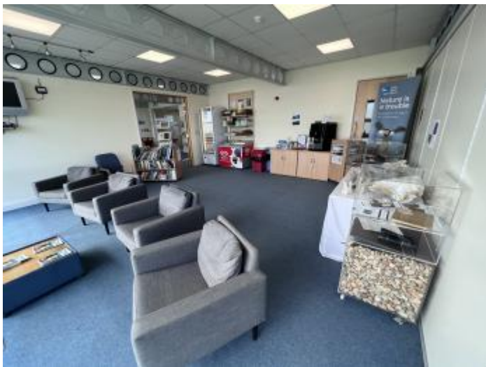
Seating area with refreshments