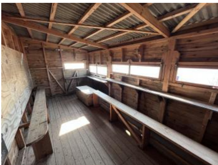
Dengemarsh Hide Interior