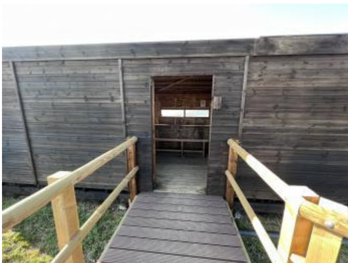
Dengemarsh Hide Entrance