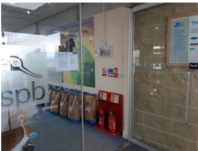
Porch Entrance Door to Visitor Centre