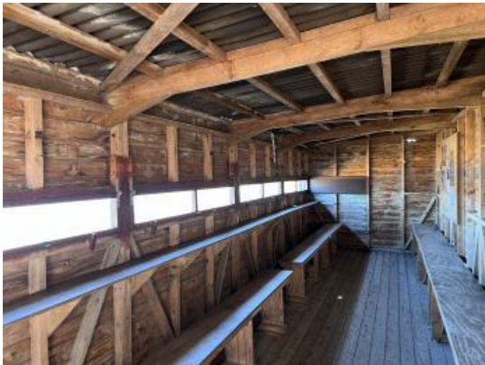
Christmas Dell Hide Interior