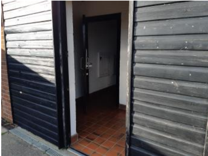
Accessible Toilet Entrance Porch