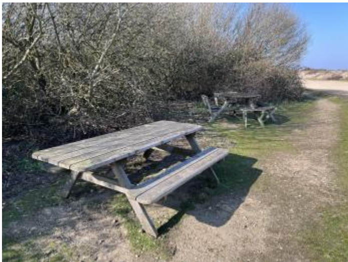
Car Park Picnic Benches