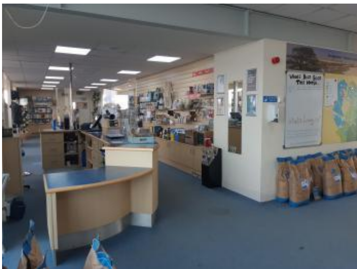
Lowered Counter at Information Desk