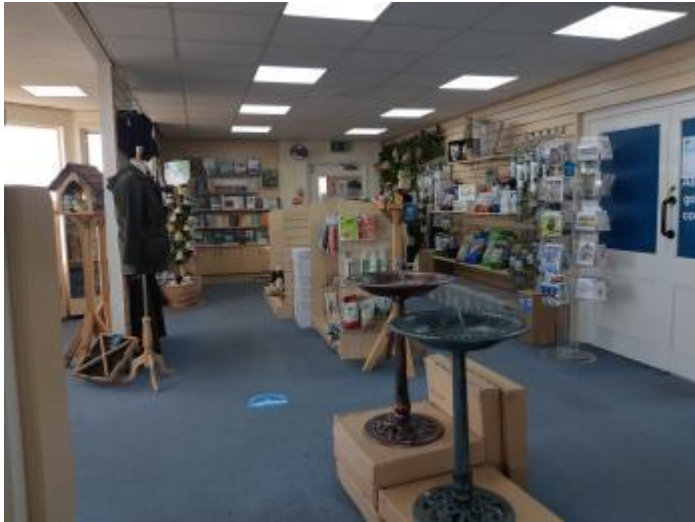
Shop View 3