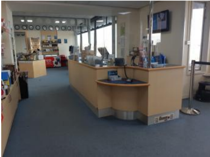
Lowered Counter for Shop Purchases