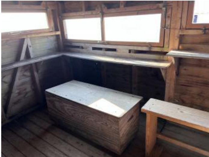
Dengemarsh Hide Accessibility Seat