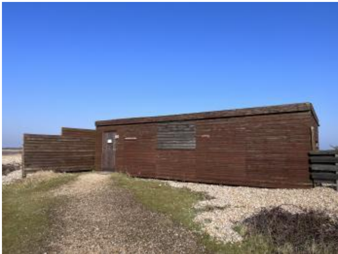
Christmas Dell Hide

Along the trail there are perching points every 150-200 metres to allow for resting along the way.