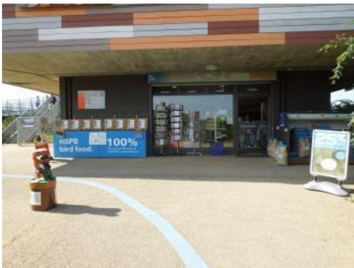
Rainham Marshes Shop

Loose seed bins are outside the shop. These can not be reached from a seated position. Staff and volunteers can provide assistance.