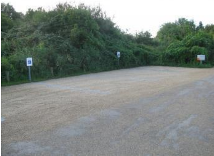
Four blue badge bays

The car park (reserve, and car park) opens at 9.30 am and is locked at 5pm (1 February-31 October), and 4.30pm (1 November-31 January).