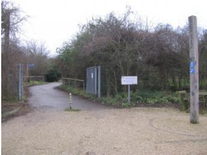
Access ramp to the visitor centre