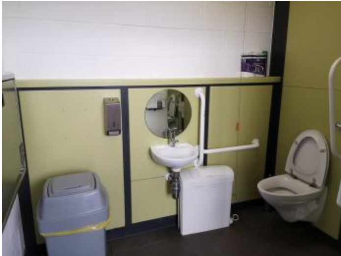
The accessible toilet on the first floor