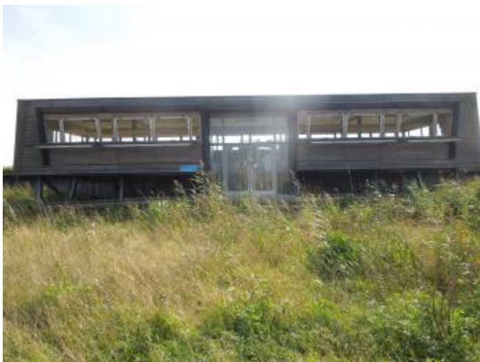
The Shooting Butts Hide