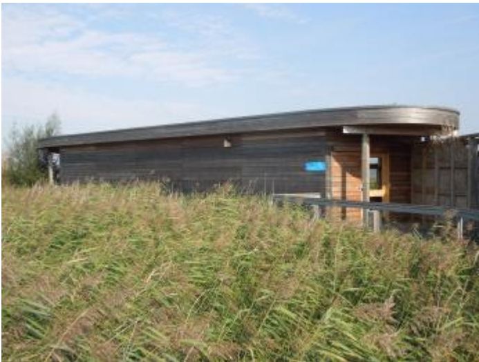
The Purfleet Hide