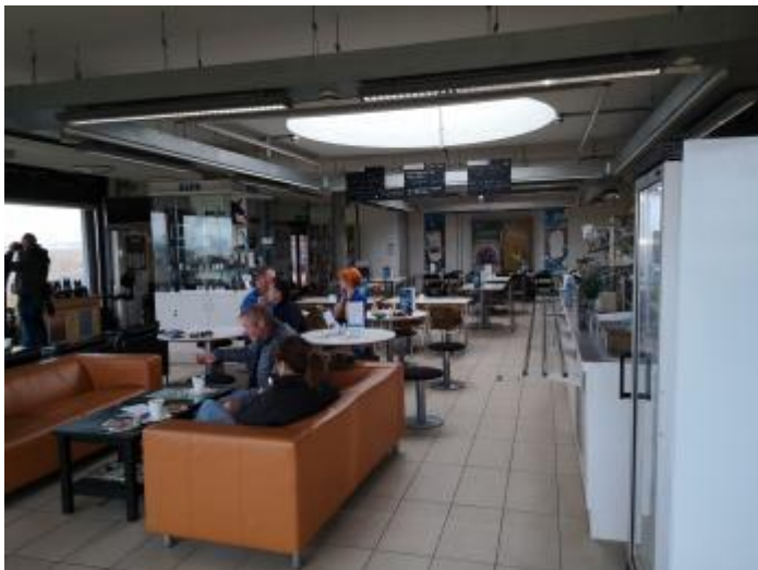
Cafe at Rainham Marshes

An accessible toilet and a baby change facility is on the veranda.