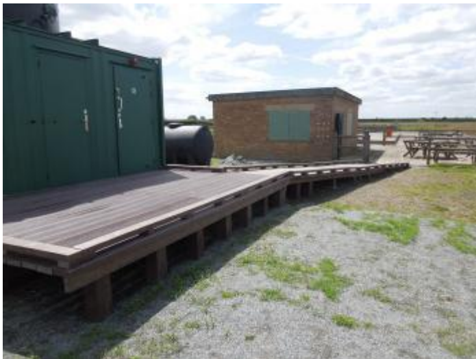
Toilets on the reserve near the Shooting Butts Hide

Well lit with automatic overhead lighting.