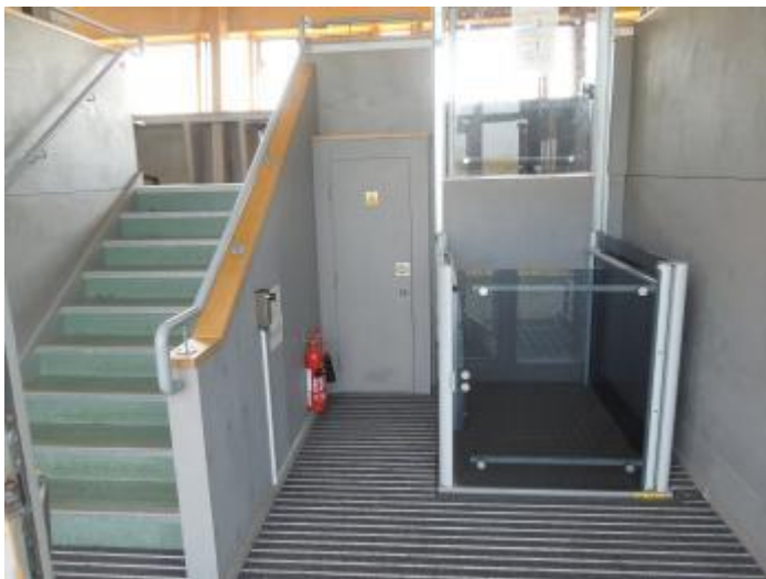
Lift in the Shooting Butts Hide