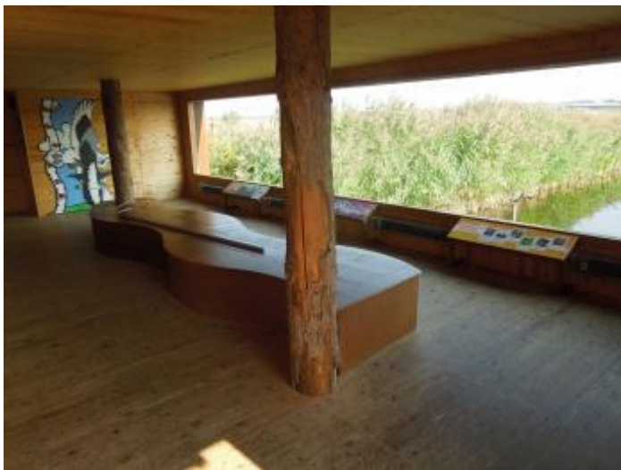
Inside the Marshland Discovery Zone Hide