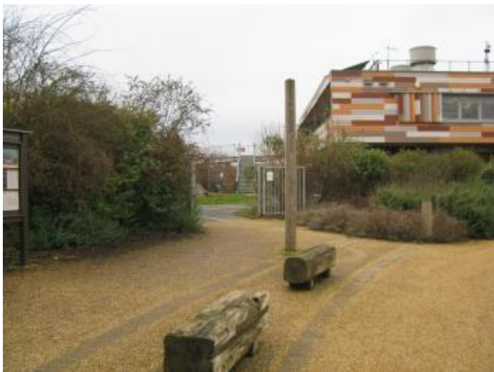
Near the ramp there is staired access to the visitor centre