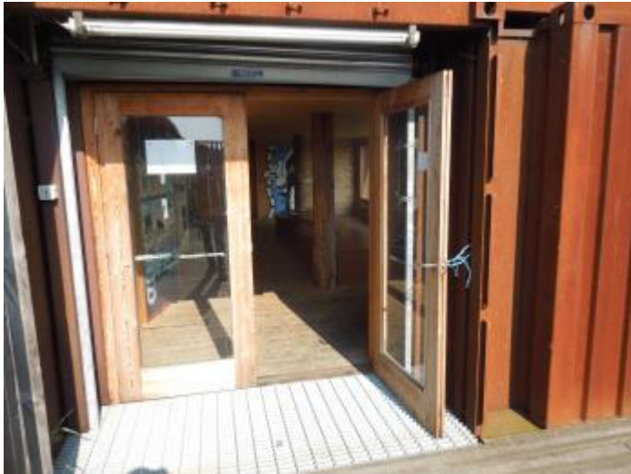
Entrance to the Marshland Discovery Zone Hide