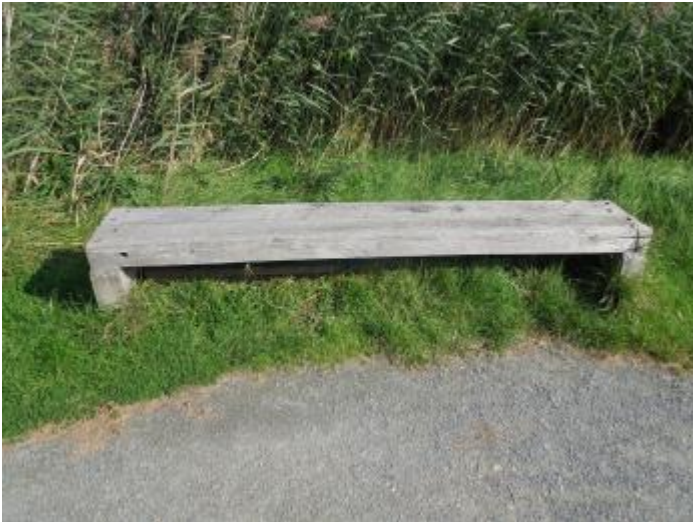
Some examples of seating on site