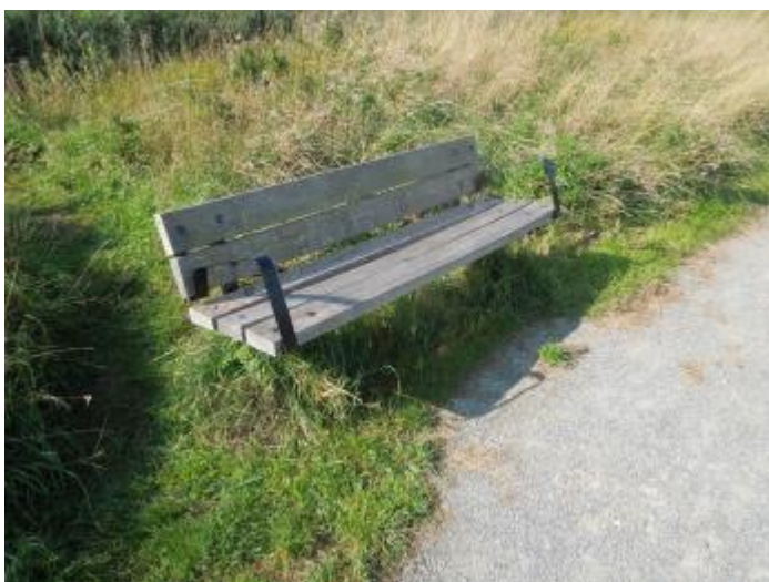
Some examples of seating on site