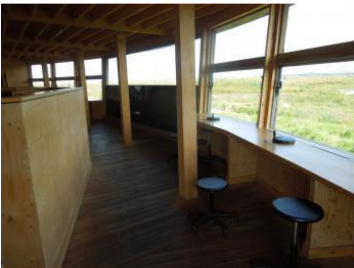
Inside the Purfleet Hide