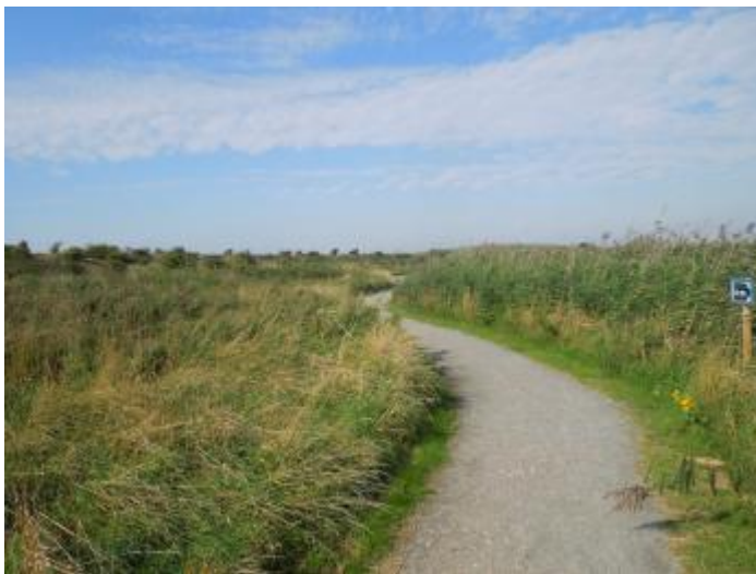
An example of hard pathway at Rainham Marshes