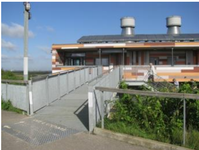
Bridge from ramp to visitor centre (reserve and cafe)

Also at this upper level there is an accessible toilet.