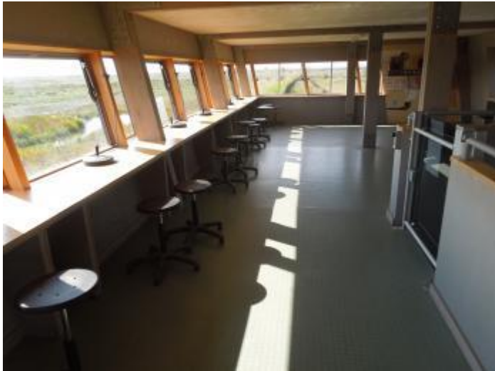
Inside the Shootings Butts Hide