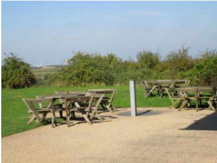
The main picnic area by the visitor centre