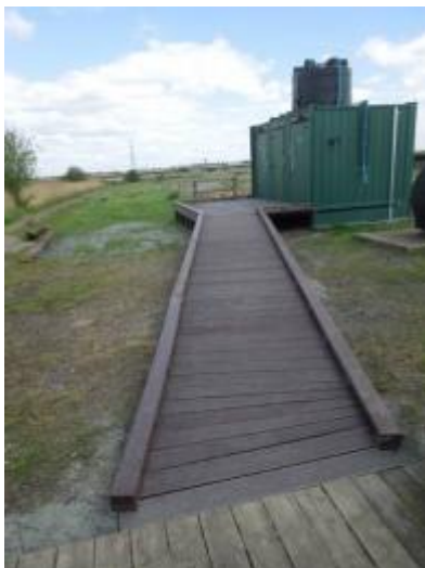
Ramp to the toilets

wide. The door opens outward and opens 180 degrees. Vertical rail on the wall to the right of the toilet with a pull down horizontal rail on the opposite side Handrails, toilet and wall mounted hand sanitiser are white. An emergency alarm pull cord - that sounds inside and outside the toilet block. Lit with automatic overhead lighting. There is not sufficient turning space in the cubicle for a wheelchair user. Please note there is not running water on this side of the reserve - hand sanitiser is available.