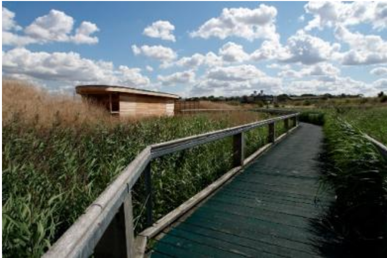
A section of boardwalk on the reserve near the Purfleet hide