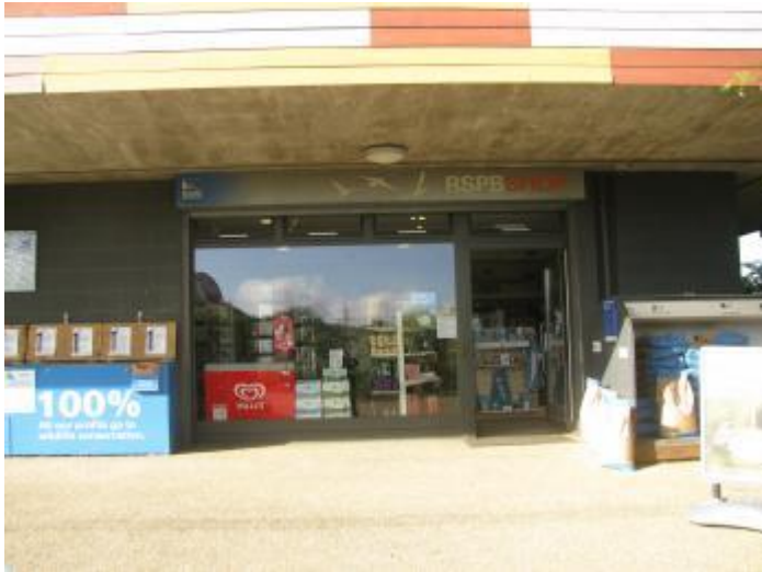
Entrance to the shop