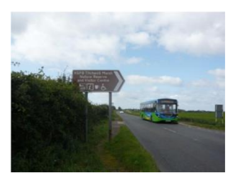
main road entrance

There is a drop-off point at the main entrance. Eight Blue Badge parking spaces are provided. For the drop-off point, follow sign for 'Deliveries'. There is a reserved space located just before the barrier.