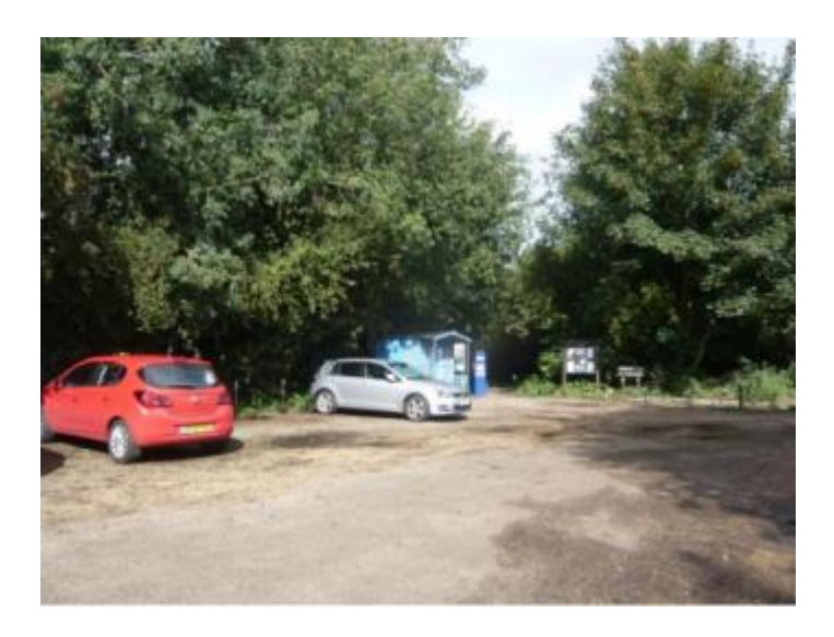
car park access spaces